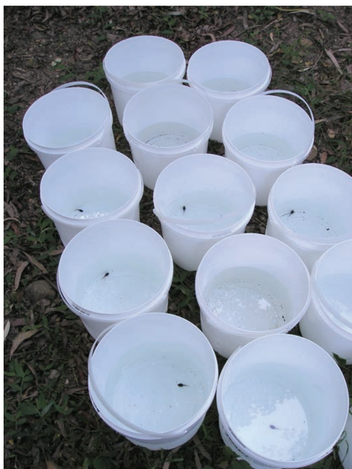
Figure 2. Mixophyes balbus tadpoles placed in separate clean containers ready for translocation.

Results from the Bd testing of swab samples taken from 12 free living M. balbus tadpoles at Macquarie Pass NP on 26 October 2006 were all positive for chytrid ( D. Hunter pers. comm. ). Results from the Bd testing of tadpoles held by Melbourne Zoo conducted on 9 November 2005 were 1 positive / 7 negative. The single positive tadpole was treated but subsequently died. Repeat analysis for Bd on the 7 remaining Melbourne Zoo tadpoles on 24 November 2005 were all negative.