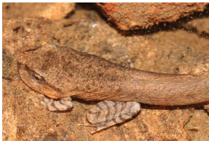
Figure 3. The last free-living Mixophyes balbus tadpole observed at Macquarie Pass NP.

During development tadpoles exhibited several changes in behaviour. When they were small (< 25 mm total length) they congregated in the shallows during the day and some hid under stones. They could be flushed from their hiding places by disturbances to the stones. The tadpoles swam into deeper water and took refuge under other stones when disturbed. Fewer tadpoles were observed during night surveys as they dispersed into deeper (circa 1.0 metre) water and presumably hid under stones. When the tadpoles were approximately 60 mm in total length they were not easily observed during the day as they took refuge under the stones in the shallows. At night they could be coaxed to leave their hiding places by poking the substrate. Animals were counted as they dispersed into the deeper water or while visible on the substrate. During the latter Gosner stages of development (stages 41-43) the tadpoles were detected (at night) in a very shallow side pool. The depth of this pool was approximately 25 mm and the tadpoles hid under the dead leaves.