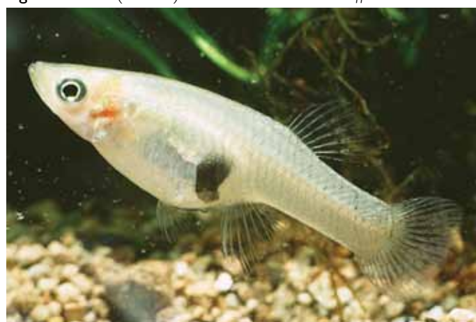
Figure 2. Female Gambusia holbrooki .

While Gambusia were used as the simplest method of controlling mosquito larvae, chemical methods were later applied to control adult mosquito numbers. DDT was the most widespread of these chemicals. It was first synthesized in 1874, but its insecticidal properties were not discovered until 1939. DDT was used with great success in the second half of World War II to limit the infection rates of malaria and typhus among civilians and troops. After the war, DDT was used as an agricultural insecticide, and soon its production and use became even more widespread (Sharma 2003). Unfortunately, as was discovered later, DDT (and many other pesticides) was responsible for producing malignant cancers and birth defects in unborn children, and its use was banned in the USA in 1972. DDT was subsequently banned for agricultural use worldwide under the Stockholm Convention, but limited, controversial use in disease vector control continues in some poorer countries (Curtis 1994).