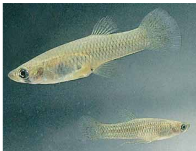
Figure 1. Male (smaller) and female Gambusia affinis .

The early 1900s marked the first time that fish were integrated into the biological control of the aquatic larval stages (wigglers) of mosquitoes. New Jersey, in the USA, was once called the "Mosquito State" because of the swarms of mosquitoes that infested the numerous estuaries dotting its shores. The introduction of G. affinis in New Jersey in 1905 (Smith 1908) was hailed as being so successful that this fish was subsequently introduced worldwide as the most cost-effective means of controlling mosquitoes (Meisch 1985). In the early 1900s, it was not known that two species of Gambusia occurred in the USA: Gambusia affinis (Figure 1), now known as the Western Gambusia, and G. holbrooki , the Eastern Gambusia (Figure 2). Together these two species of fish are called Plague Minnows, Top Minnows or Mosquitofish and are now the most widely distributed species of fish in the world (Pyke 2005). They have been transported and have established on every continent except Antarctica (Krumholz 1948). Gambusia releases are still carried out today in the USA for military (Scholdt et al. 1972) and civilian (Ken et al. 1994) purposes.