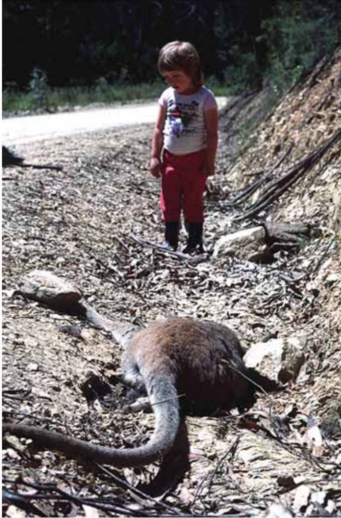
Wildlife killed on the road is a national disaster. The photo here of a small child looking at a recently-killed Red-necked Wallaby Macropus rufogriseus is not newsworthy. The media is selective in how it presents wildlife disasters in the news.