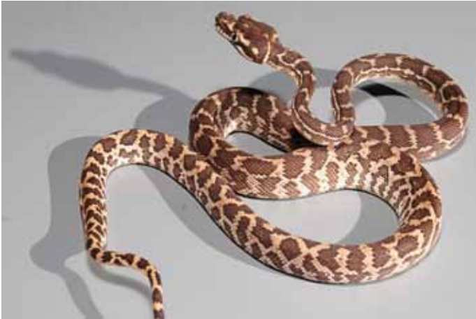
Figure 3. Young rough-scaled python, Morelia carinata, showing elongate morphology.

About half of these offspring were transferred to other zoological facilities for captive maintenance, and a studbook is being maintained for this species at the Australian Reptile Park in accordance with recommendations of the Australasian Regional Association of Zoological Parks and Aquaria, with a view to coordinating regional breeding of this species. However, all data on captive specimens in the present paper derive from observations made at the Australian Reptile Park.