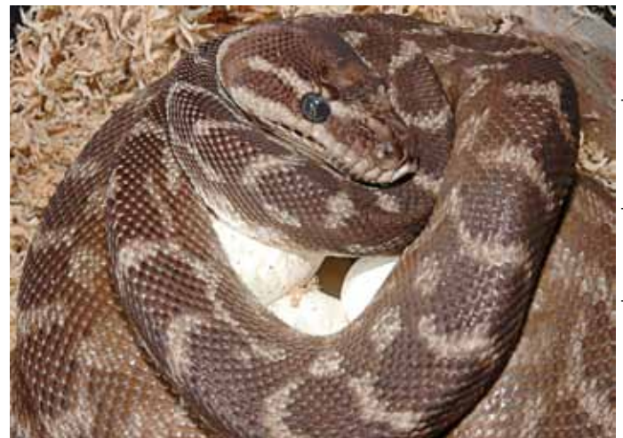
Figure 2. Adult female rough-scaled python, Morelia carinata , coiled around her freshly-deposited eggs.

with mature females during the mating season (late July to late August). At the time of the pre-lay slough, nest boxes measuring 300 x 200 x 200 mm high with 100 mm access holes were installed and filled with 20–30 mm of slightly moist sphagnum moss. In all instances oviposition occurred at night or very early morning and always took place within the nest boxes. When females were discovered after oviposition, they were always tightly coiled around the clutch (Figure 2). Temperature within the nest boxes was maintained at 29–30°C, perhaps accounting for the lack of observed thermal shivering by captive females. Eggs were removed from the females (generally in one tightly adherent mass) and incubated at 30.5–31.5°C using a no-substrate incubation technique whereby the eggs are enclosed within a container and suspended on a perforated plastic platform above a shallow pool of warm water. This system maintains a nearly constant 100% humidity around the eggs while allowing unfettered gaseous exchange across the eggshell (Weigel 2007).