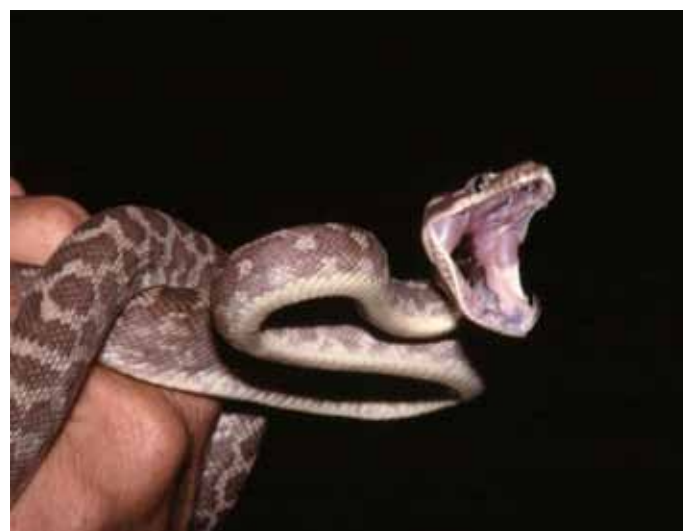
Figure 1. Defensive posture of newly-captured rough-scaled python, Morelia carinata .

One of the original rough-scaled pythons disgorged a rock rat when captured (Weigel 2007). Most captive-bred hatchlings readily accepted recently killed domestic mice as food. Those that refused rodents continued to do so until mice were scented by rubbing with live striped marsh frogs Limnodynastes peronii , or with day-old Japanese quail Coturnix japonica . We have never observed overt tail-luring for prey in M. carinata , although this behaviour is common in juveniles of the closely related