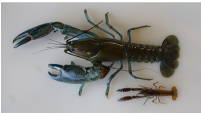
Figure 3. Both mature adults captured together Wamberal, NSW. Top: Translocated Cherax destructor 102 grams, 56.44 mm OCL. Bottom: Endemic Gramastacus sp., 4 gram, 17.36 mm OCL.

The aggressive nature of C. destructor is a major concern for