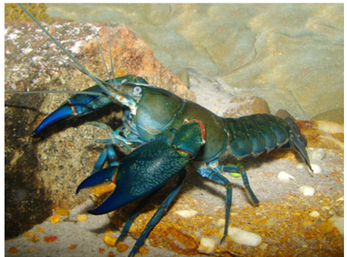
Figure 1. The blue claw yabby Cherax destructor .

Freshwater crayfish surveys of eastern NSW were undertaken as part of the Australian Crayfish Project (ACP) and targeted sub-projects of specific regions. The ACP is surveying the whole of eastern Australia from Pajinka, Cape York, the northernmost point, to Wilsons Promontory, Victoria, the southernmost point of mainland Australia. The ACP records the freshwater crayfish species present at thousands of survey sites to provide baseline data of the species present in a particular section of stream at a set point of time. In this paper we document the ACP records of C. destructor translocations in NSW and record our observations of interactions with the aim to further our understanding of the threat to eastern endemic crayfish.