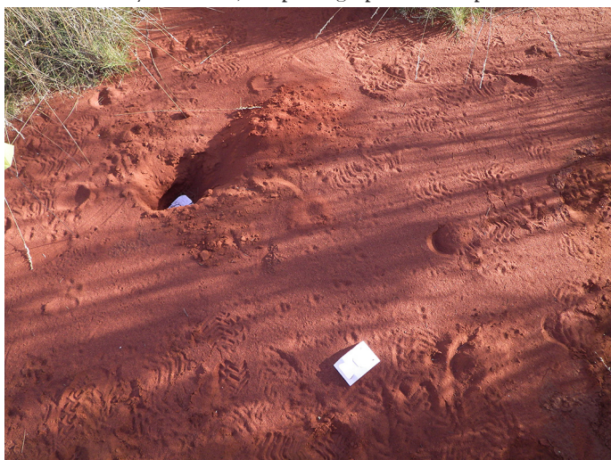
Figure 1. Example of a pair of traps installed in a bilby foraging pit and on the undisturbed soil surface.

Image analysis was used to determine if the amount of soil captured on the traps varied significantly between foraging pits and undisturbed soil. Each trap was photographed from directly overhead, the photographs were imported into the