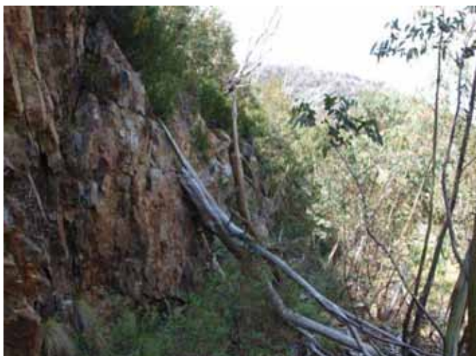
Site of the first capture of female with young on the edge of the access track on the crest of Happy Jacks Spoil Dump I.