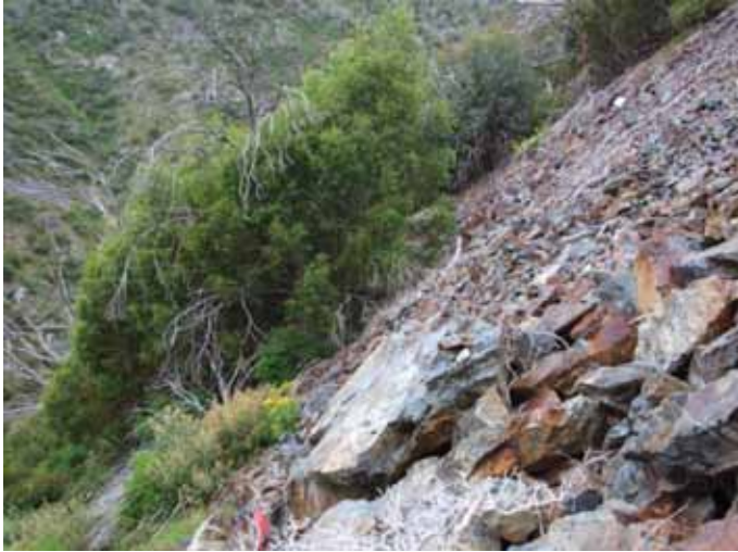
Capture site of immature male at base of Happy Jacks Spoil Dump 4.