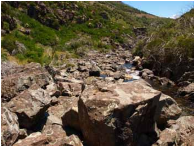
Immature male capture site at base of Happy Jacks Quarry just above Happy Jacks Creek.