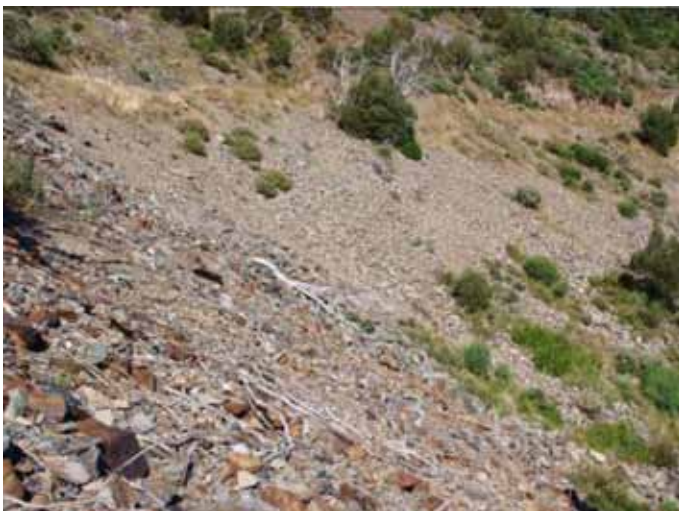
Eight captures were made in the modified natural shallow scree below Happy Jacks Road.