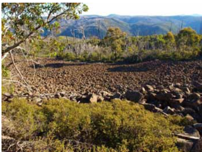
Typical Burramys parvus boulderfield habitat at Snowridge near Cabramurra with Mountain Plum-pine in the foreground.