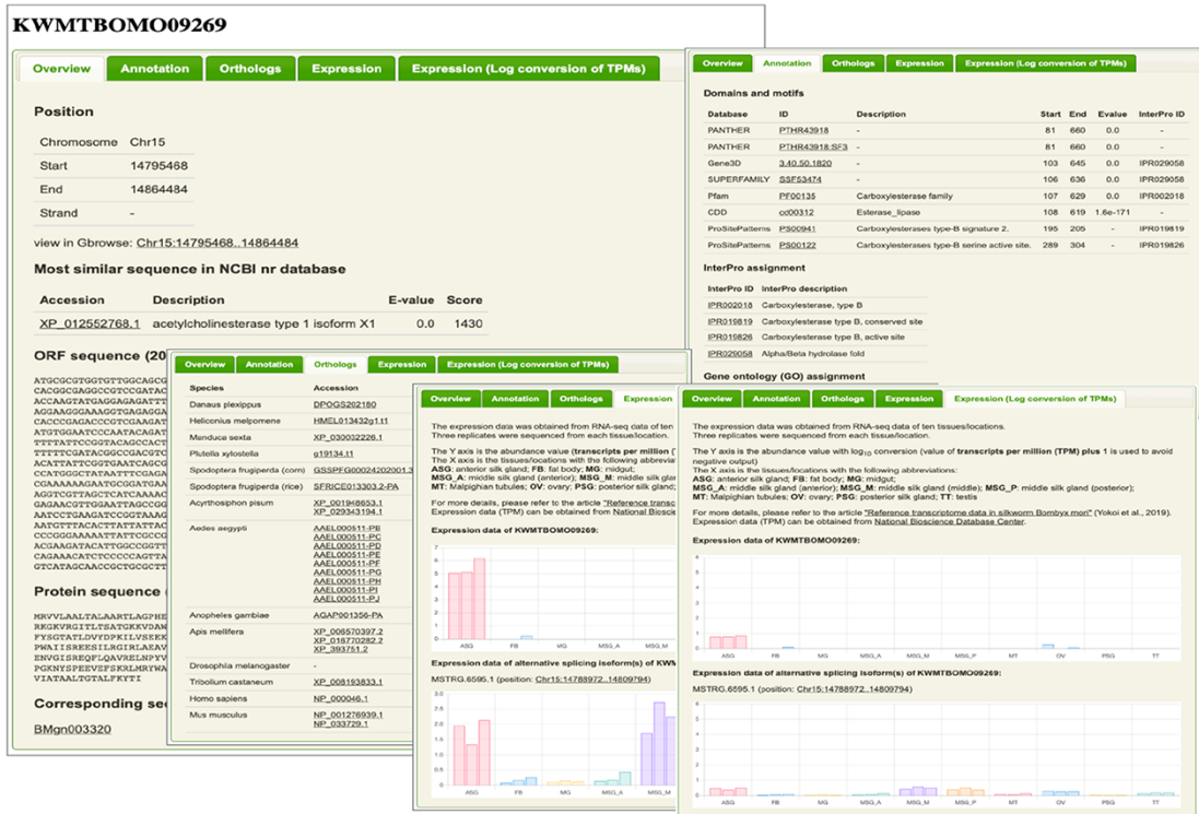
Figure 2. An example of description page. The information of chromosomal positions, nucleotide and amino acid sequences, functional annotations, orthologs and expression patterns [original transcripts per million (TPM) values and log 10 conversion of TPM values with an offset of 1] are shown.