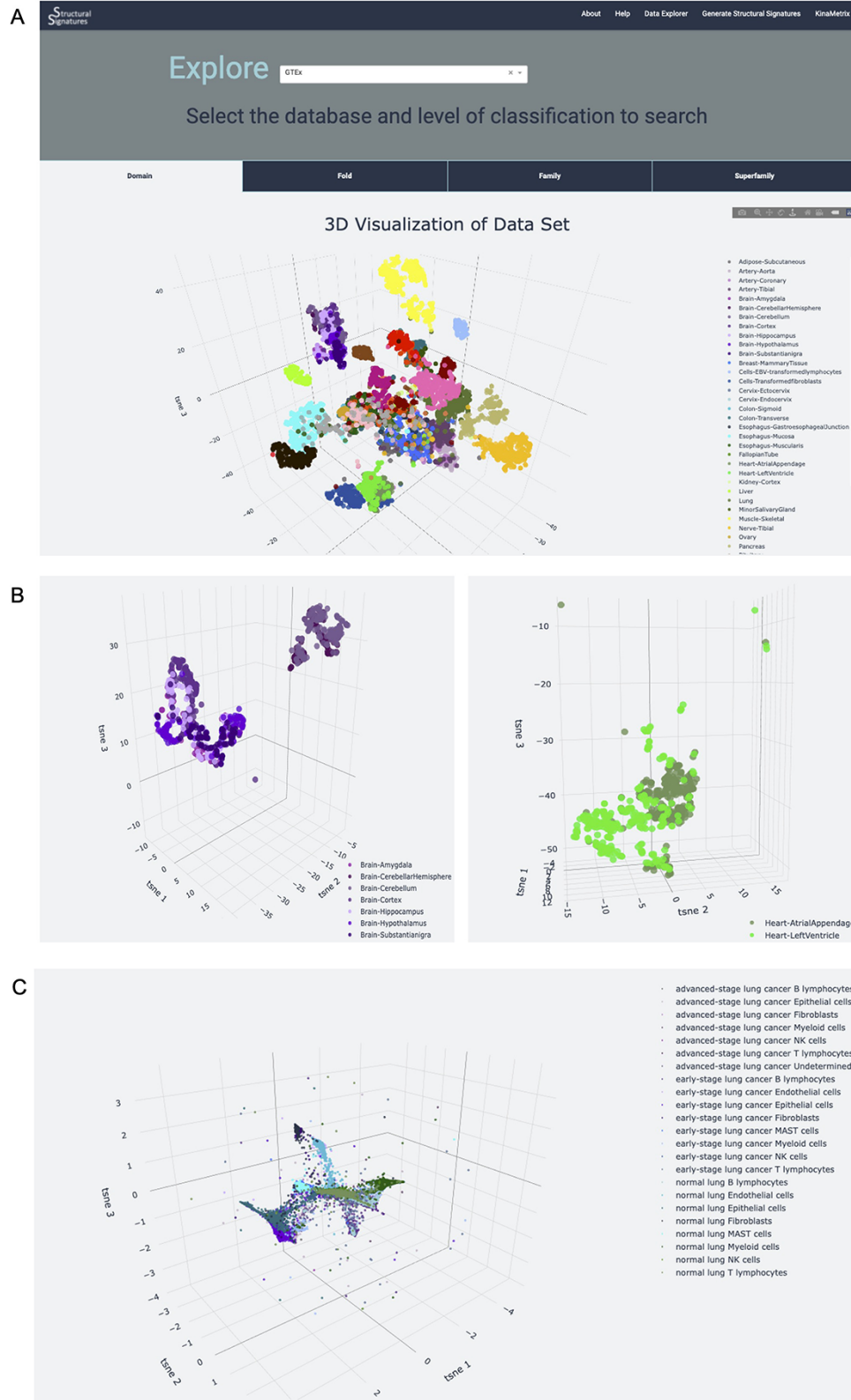
Figure 3. Database explorer page. (A) 3D t-SNE with GTEx tissues based on the features of the expressed proteins. (B) 3D t-SNE with brain and heart sub-tissues as seen on the server (C) 3D t-SNE on lung adenocarcinoma structural features.

The server also allows users to explore the structural features of normal human tissue samples in the GTEx (7) and ARCHS4 (8) databases (Figure 3). These data serve as a