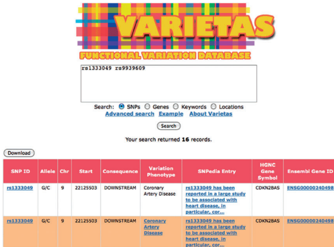
Figure 2. Screenshot of Varietas' user interface showing partial results for basic query for a set of SNPs. Queries can be performed based on given set of variations, genes, keywords or genomic locations. Links in the results table can be followed to external information resources.

results are displayed). The main functionality of Varietas is to enter a batch of SNPs, genes, locations or keywords, and retrieve linked genomic variations, genes and related information such as gene and SNP descriptions and information about linked diseases and publications. Results are provided to users as a table that includes links to external resources. Results can also be downloaded as a tab-delimited text file for further processing with the users favorite spreadsheet software and bioinformatics tools. The web UI has been implemented using PHP and JavaScript programming languages.