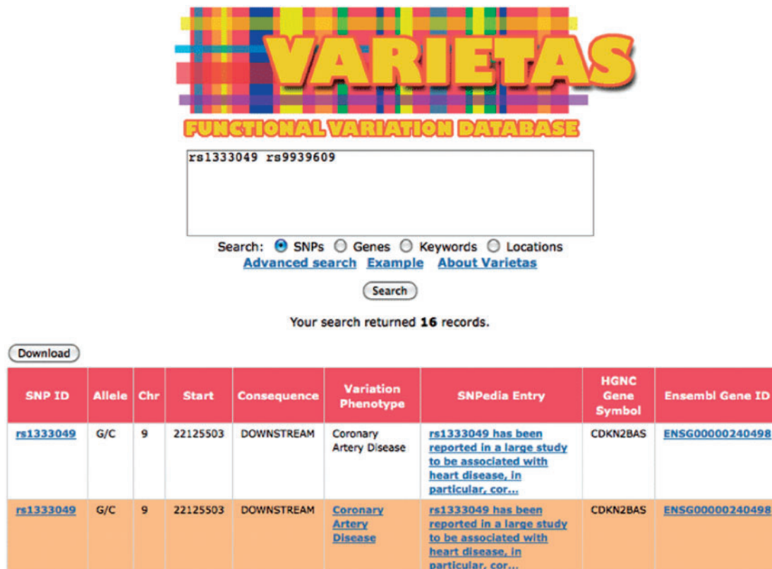
Figure 2. Screenshot of Varietas' user interface showing partial results for basic query for a set of SNPs. Queries can be performed based on given set of variations, genes, keywords or genomic locations. Links in the results table can be followed to external information resources.

results are displayed). The main functionality of Varietas is to enter a batch of SNPs, genes, locations or keywords, and retrieve linked genomic variations, genes and related information such as gene and SNP descriptions and information about linked diseases and publications. Results are provided to users as a table that includes links to external resources. Results can also be downloaded as a tab-delimited text file for further processing with the users favorite spreadsheet software and bioinformatics tools. The web UI has been implemented using PHP and JavaScript programming languages.