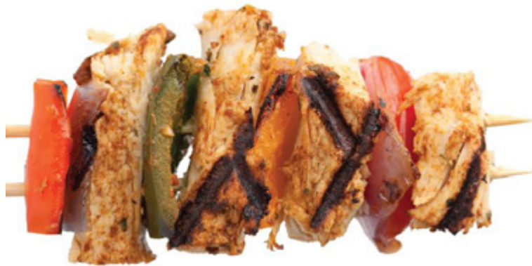
Figure 1. Companies like Beyond Meat (plant-based chicken strips, left-hand side) and Impossible Foods (plant-based burger, right-hand side) have reimagined meat using plants. These newer products appeal to omnivores who are seeking to swap out meat at some meals — so-called “flexitarians” — which is driving the unprecedented growth of the plant-based meat category.

posed by intensive industrialized animal agriculture are growing reasons for concern. At its most dire, there is a looming food security issue that cannot be ignored. There is simply not enough arable land – even if all the world's remaining forests were cleared – for us to continue producing meat in the way that we currently do. Incremental efficiency improvements are insufficient to get us past the fundamental thermodynamic Sisyphean challenge of funneling calories through a living, breathing, metabolizing animal. One could hardly dream up a more inefficient system for creating food.