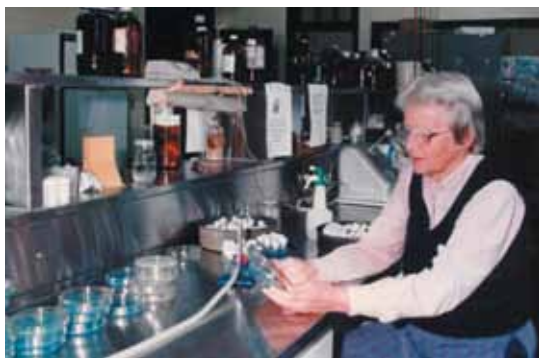
Figure 2. The Brazilian scientist Professor Johanna Döbereiner (1924–2000) who discovered Gluconacetobacter diazotrophicus in sugarcane in Alagoas, Brazil, jointly with Vladimir Cavalcante.

a portal of entry large enough for bacterial penetration, becoming intracellular via endocytosis into membrane-bound nitrogen-fixing symbiosomes. Rhizobia are then trapped inside nodule cells and are unable to become systemic in the crop, and hence are unable to utilize the cells of the root, stem and leaves outside of the nodule as a habitat for symbiotic nitrogen fixation. Other endophytic microorganisms are more versatile. In the leaf glands of the non-legume garden plant Gunnera the nitrogen-fixing cyanobacterium Nostoc establishes intracellular symbiotic nitrogen fixation without any nodule formation; and in the intracellular root symbioses of legumes and non-legumes, including cereals, with phosphate-acquiring arbuscular mycorrhizal fungi there is no nodulation. Establishing symbiotic nitrogen fixation in crops, without nodulation, will require not only extensive systemic intracellular colonization by diazotrophic bacteria but also the protection of their nitrogenases from inactivation by oxygen. For instance, the nitrogenase complex of rhizobia is readily inhibited by oxygen, and rhizobia are now regarded as being unable to establish symbiotic nitrogen fixation in non-legume crops; regulating the flux of oxygen to endosymbiotic rhizobia has been suggested to be an insuperable challenge to the dream of effectively introducing rhizobial nitrogen-fixing symbiosis into non-legume crops.