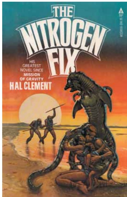
Figure 1. The Nitrogen Fix The front cover illustration by David B. Mattingly of a novel of the ultimate ecological disaster (Reproduced with permission).