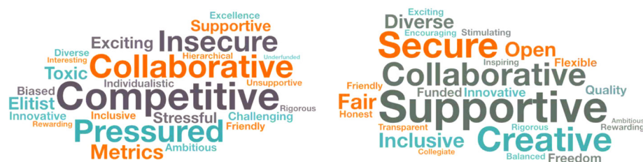
Figure 1. The different words used by researchers to describe current (left, n=2839 – UK and international) and an ideal (right, n=4079–4110 – UK and international) research culture. Image from Wellcome report What researchers think about the culture they work in ( https://wellcome.ac.uk/reports/what-researchers-think-about-research-culture ).

Our report confirms that current practices are unsustainable. They are having a detrimental effect on wellbeing and undermining the quality of the work produced.