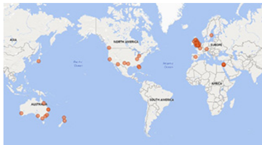
Biochemical Society and Portland Press Read & Publish institutions.

Making this change in a sustainable manner is the key to ensuring we can continue to support our communities, wherein Read & Publish forms the basis of our next steps in transitioning to full OA. SocPC members published over 120,000 articles in 2018, investing the generated surplus from this work back into the research community. Over £800 million was collectively spent by SocPC members