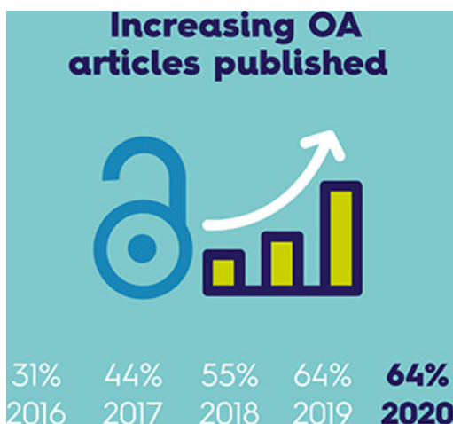
Percentages across all Biochemical Society and Portland Press journals.

From the point that our journal portfolio moved to a hybrid publishing model back in 2009, which first introduced the option for authors to choose open access (OA) publication, the Biochemical Society and our publishing arm, Portland Press, have been on the path towards more open scholarship. Key milestones since then have included the ‘flipping’ of our journal, Bioscience Reports , to full OA publishing in 2012, which helped shift the proportion of OA articles across our journals to well over 50% in recent years (see accompanying figure). Associated objectives really gathered pace in 2017, when the decision to focus on the sustainable transition of all our journals to full OA was made. Open Science and Open Scholarship position statements effectively encompassed our agendas on this front, authored in 2018 and 2019, respectively, with the launch of our pilot Read & Publish model in late 2019 representing a real-world implementation of our transformative approach.