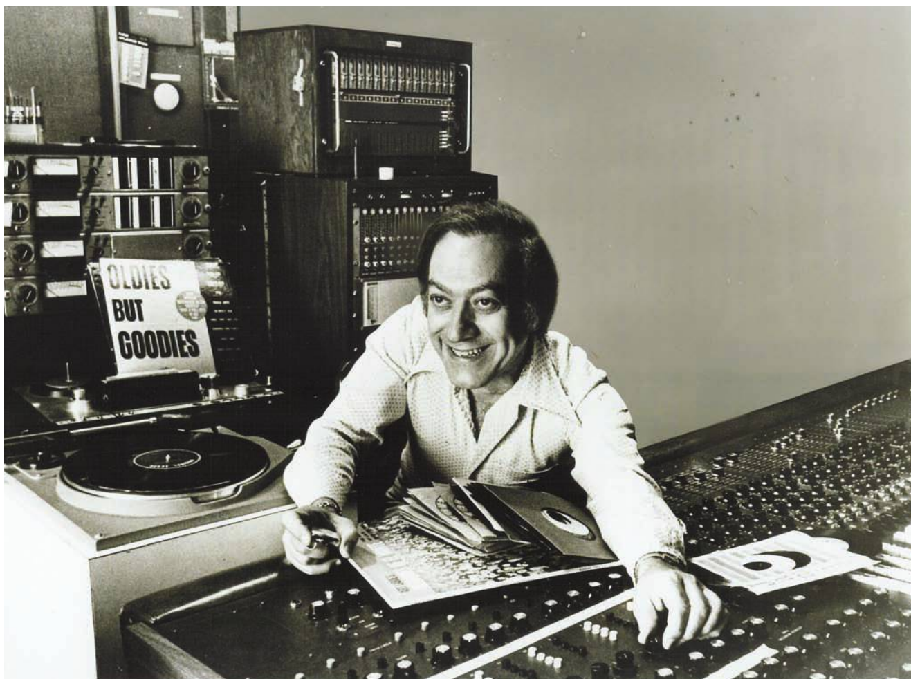
Art Laboe in KRLA studio, 1977

years ago at Target has trouble tuning in the station, I feel old. I'm forty-nine. But I stand at the sink, looking out the window at the long, dark four-lane avenue that leads directly east, to Colton and San Bernardino and then the Cajon Pass and the Mojave Desert, while hearing "Memories of El Monte," a song you might only hear on Art Laboe's show, and I realize that his voice is as totemic and Californian as the missions, each built a day's journey from the next to unite the whole sprawling state. His voice does the same. I cannot explain that to my daughters, listening to this litany of love and heartbreak and memory in this immense