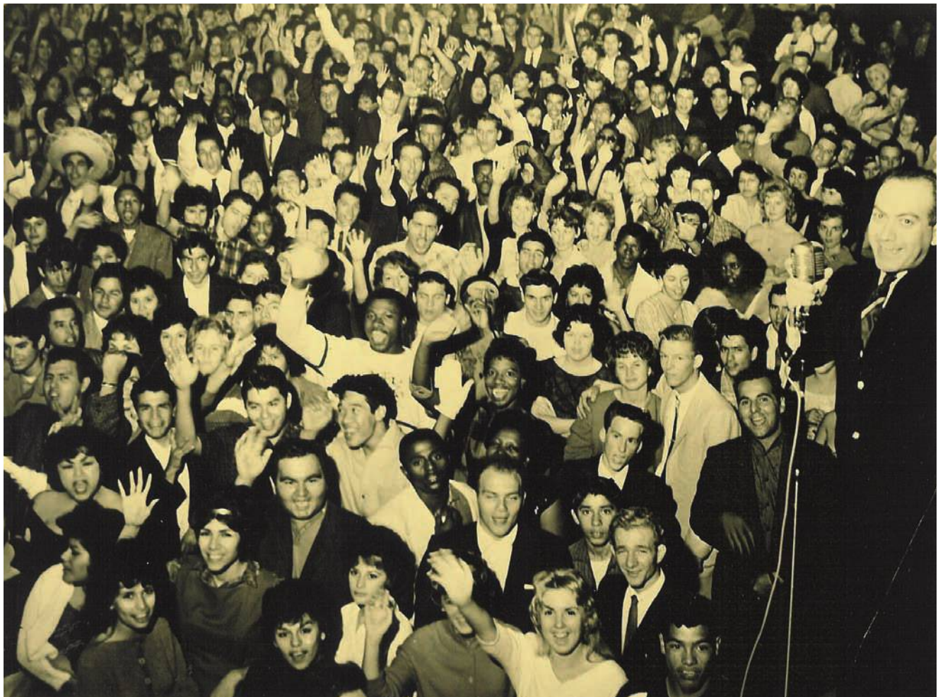
Art Laboe hosts a dance, El Monte Legion Stadium, 1957

houses. It sounds grand, only these are small wood-frame buildings—one is 950 square feet and one 650 square feet—and my neighbors have for two years been building the new parts themselves.