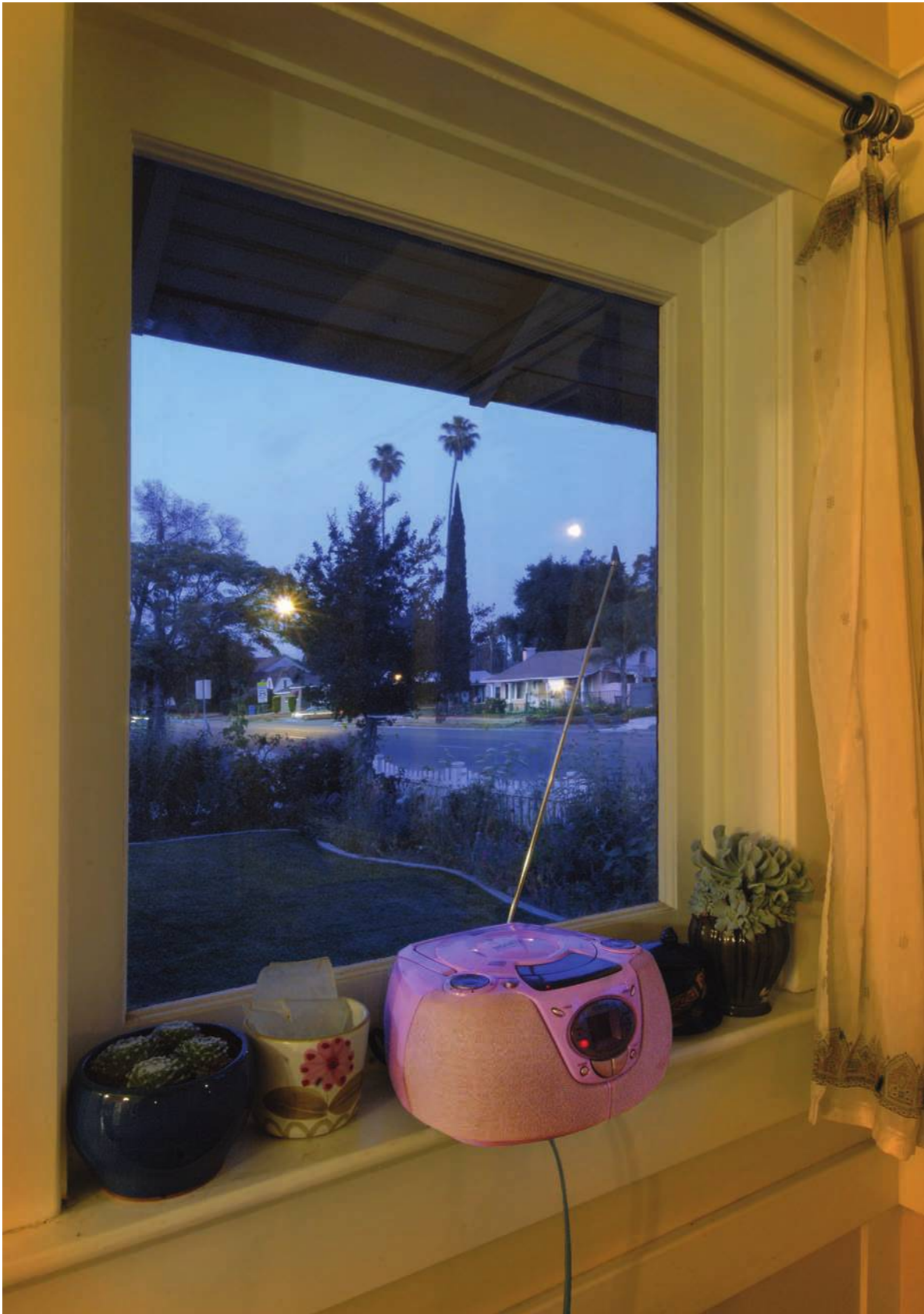
Susan Straight's north-facing kitchen window with lavender radio, June 1, 2010