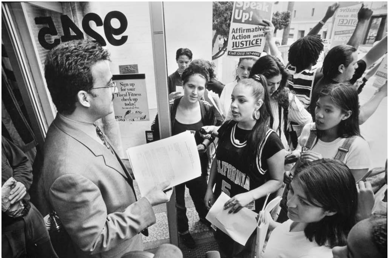
High-school and college students protest Proposition 209, 1996

the “courts have said we are not going to tolerate segregated [by law] schools. Now we’re turning around and saying we’re not going to tolerate integrating them by law either.” 49 Sixty-three percent of California voters approved of his measure in the November election, prompting several school districts to suspend ongoing desegregation programs. State courts, however, eventually determined that Proposition 21 violated the equal-protection clause of the state constitution and insisted that school districts had a constitutional mandate to provide a desegregated and equitable education to all students. 50