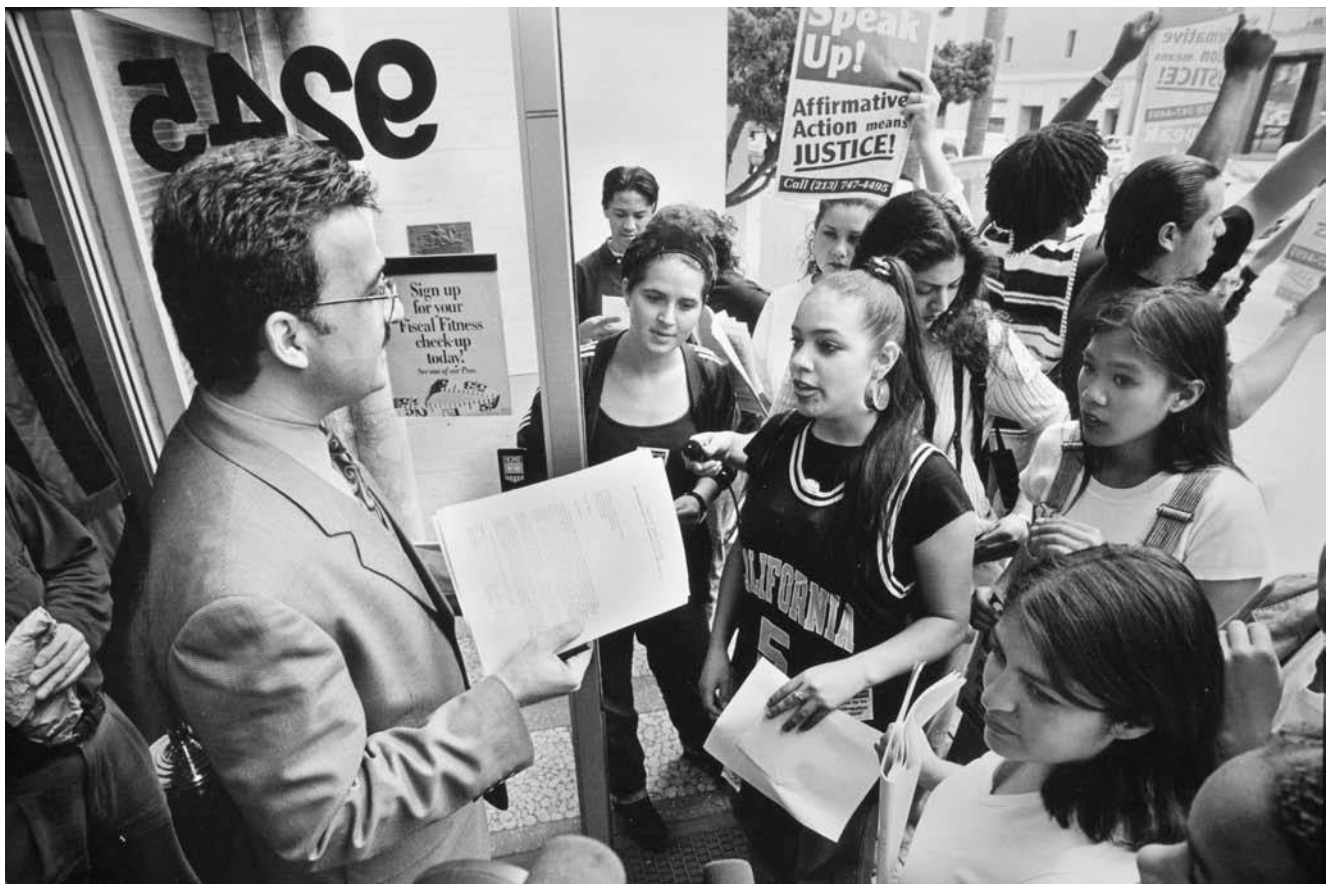
High-school and college students protest Proposition 209, 1996

the “courts have said we are not going to tolerate segregated [by law] schools. Now we’re turning around and saying we’re not going to tolerate integrating them by law either.” 49 Sixty-three percent of California voters approved of his measure in the November election, prompting several school districts to suspend ongoing desegregation programs. State courts, however, eventually determined that Proposition 21 violated the equal-protection clause of the state constitution and insisted that school districts had a constitutional mandate to provide a desegregated and equitable education to all students. 50