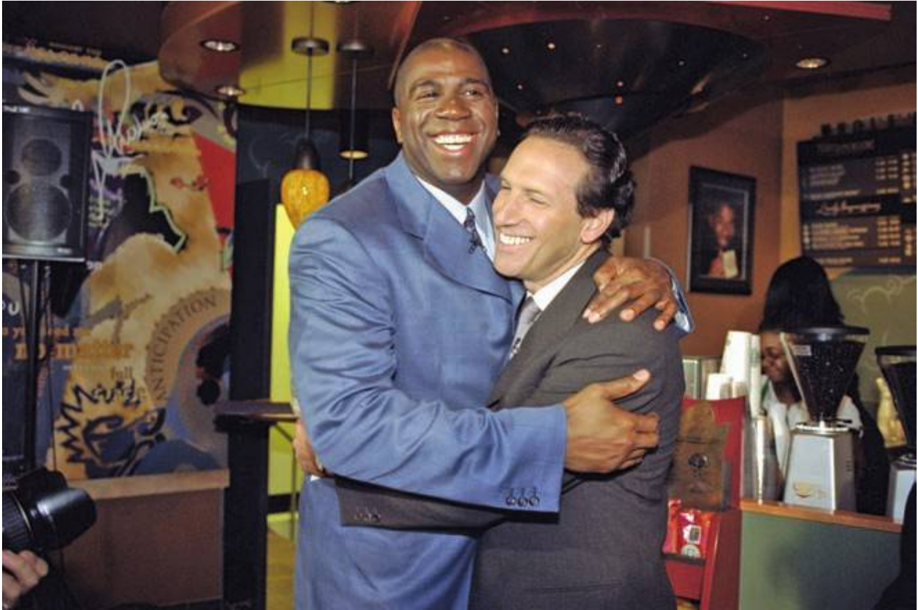
Magic Johnson shares a hug with Starbucks chairman Howard Schultz

of retail justice , of inclusion in the world of branded buying, as he set about remaking the shopping landscape of South Central Los Angeles, beginning with the Sony movie theater that he opened up at the Baldwin Crenshaw Plaza in 1995.