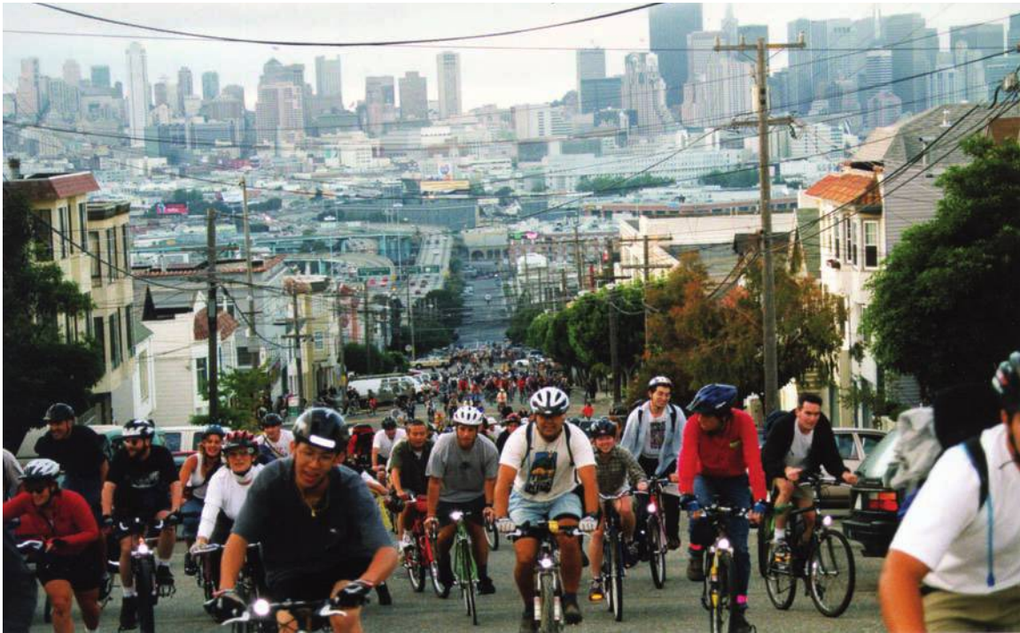
San Francisco Critical Mass riding south on Vermont Street in August 1999, photo taken from the 20th Street crest of the hill looking north.

“How to Make a Critical Mass,” 8 which we sent out to anyone who requested it, only a couple of dozen by the end of 1993.