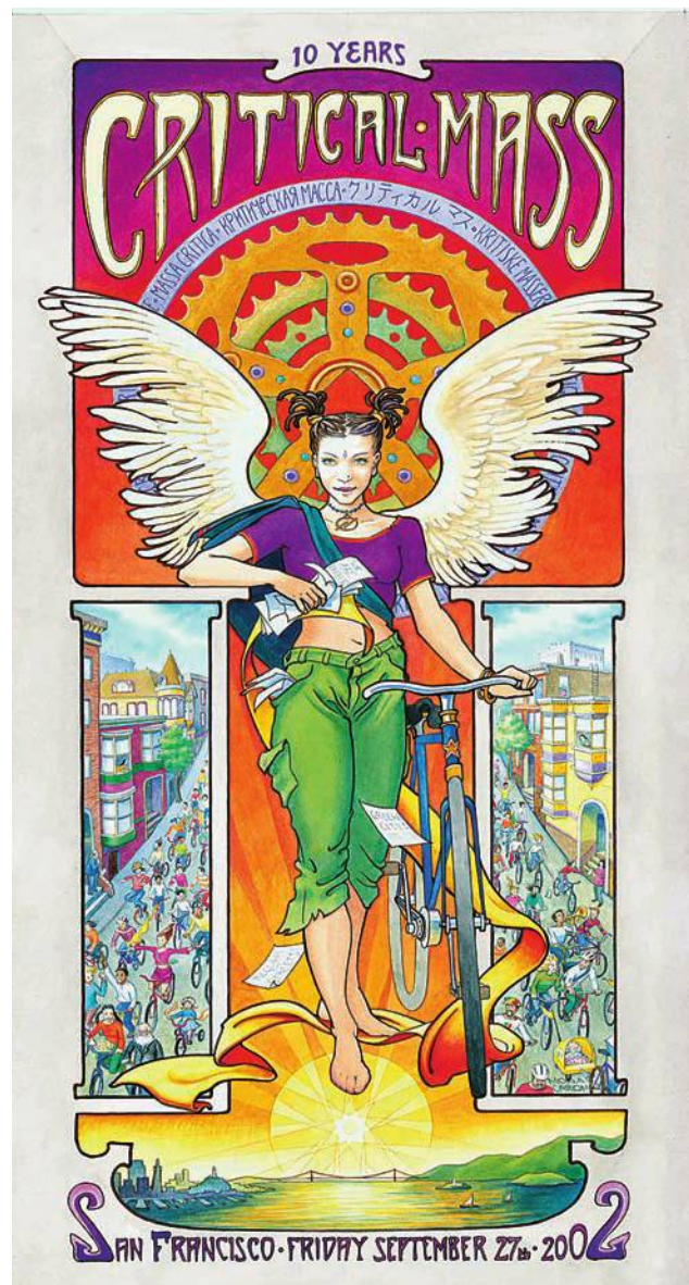
Critical Mass poster for the 10th anniversary ride in 2002

The crowded, diseased, and dangerous streets of the nineteenth century were an additional motivation for progressive