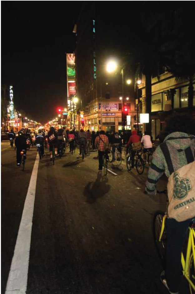
Critical Mass riding in Los Angeles, March 2011

Love , Chainbreaker , Sin on Wheels , Mercury Rising , to name a few). Lately such quality periodicals as Boneshaker magazine from Bristol, England, Bike Monkey from Santa Rosa, California, Dandyhorse from Toronto, and Momentum from Vancouver, Canada, have given the new bicycling culture aesthetically beautiful, editorially thoughtful media of its own.