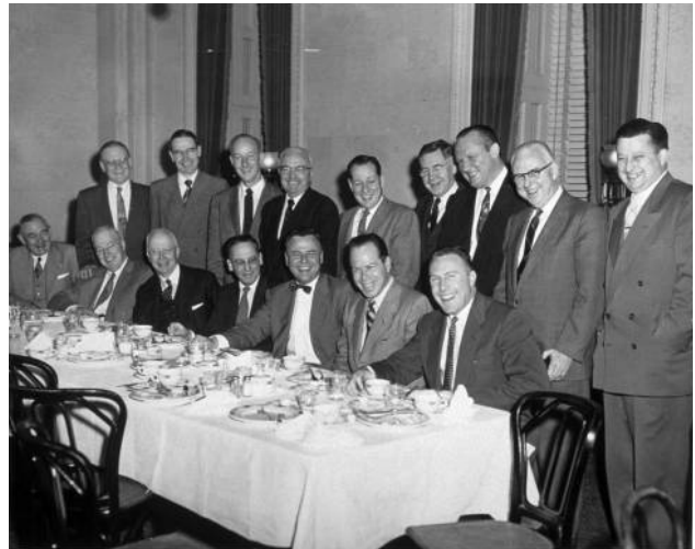
California Congressional Delegation Breakfast, March 23, 1955.

Kuchel's brand of progressive Republicanism claimed deep roots in the political soils of California. Contrary to the liberal-Democrat persona often ascribed today, the Republican Party commanded an influential majority in the Golden State for most of the twentieth century, guiding much of California's development in the areas of industry, education, conservation, and social reform. At the forefront of the state's GOP stood Hiram Johnson, the two-term governor (1911–1917) and long-time US Senator (1917–1945) for California. Considered one of the founders of American Progressivism, Johnson crafted a type of Republicanism that balanced conservative and liberal ide-