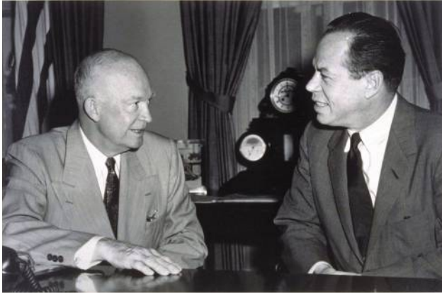
Thomas Kuchel with Dwight Eisenhower.