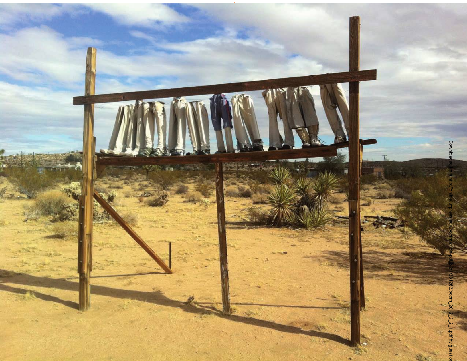
From the Point of View of Little People.

masterpiece in the desert provided Purifoy with mythic depth and a metaphor for both devastation and restoration. For every serrated edge, for every “broken” object here, there is always a connection to another object, which in turn connects