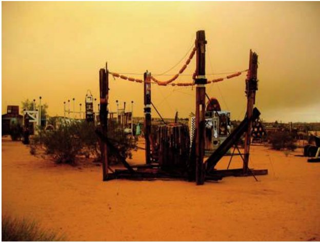
Shipwrecked , during the Sawtooth Complex Fire, 2006.