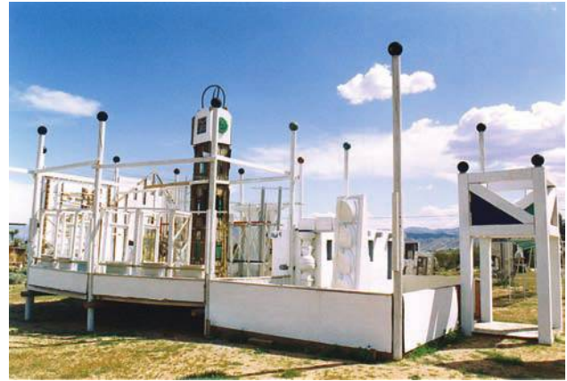
The White House.

Purifoy insinuated himself into the very earth.