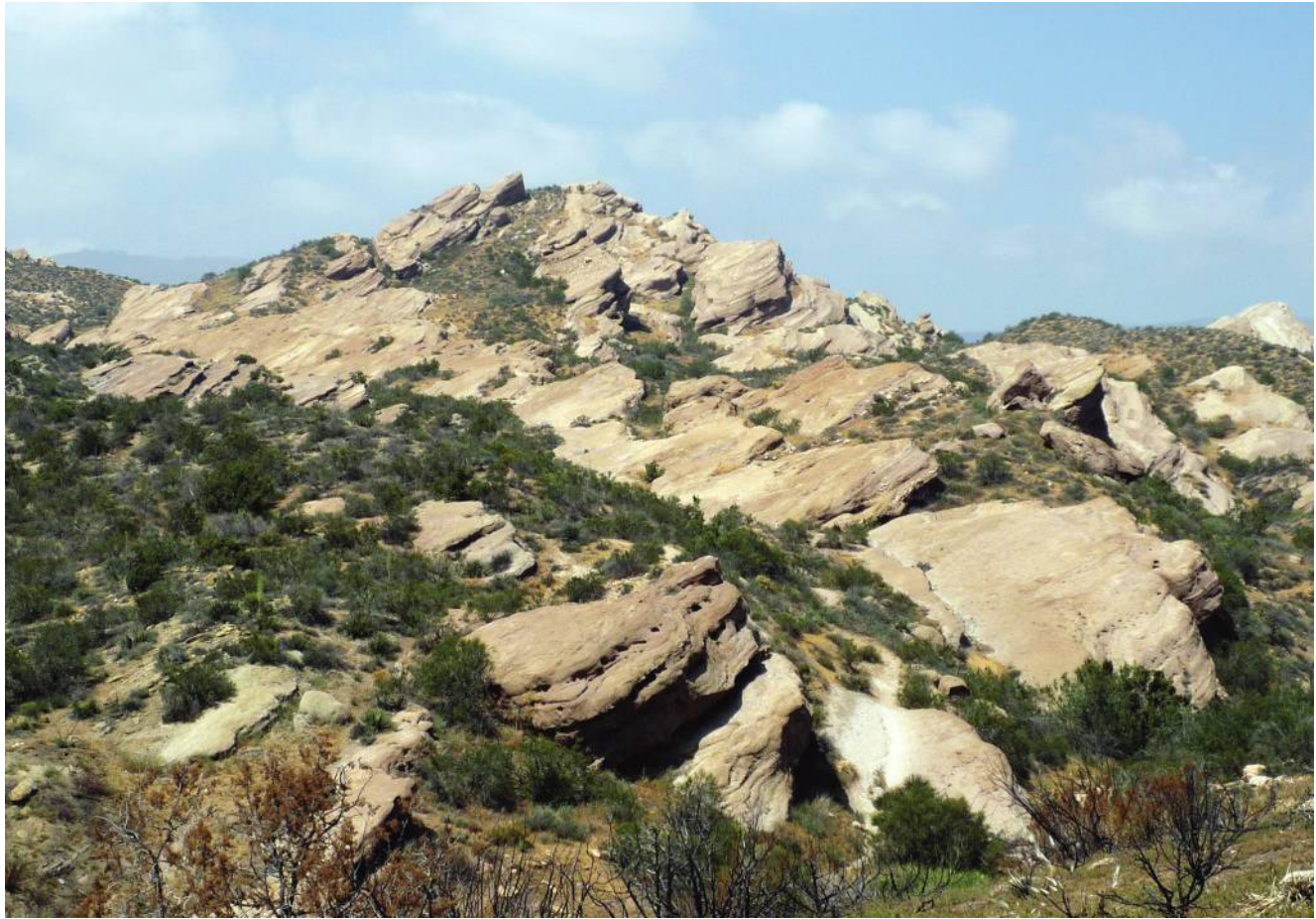
Vasquez Rocks.