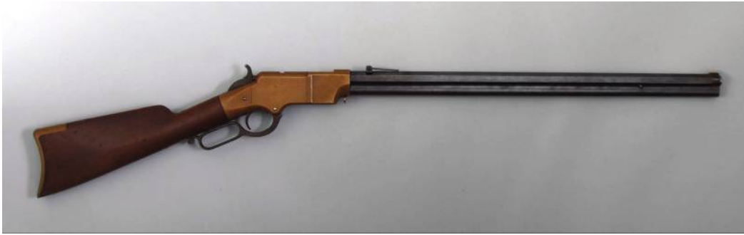
Typical Henry Rifle.

has no health insurance, and extreme cuts to Medi-Cal are planned. 6 Over 2.2 million are unemployed. 7 In 2010 the state's median household income fell 4.6 percent, the largest decline in a single year since record keeping began. According to a recent poll by the Public Policy Institute of California, nearly half of California adults now consider themselves among the have-nots. 8 These figures are even more alarming because, as the pundits often note, ours is a bellwether state. As California goes, so goes the nation.