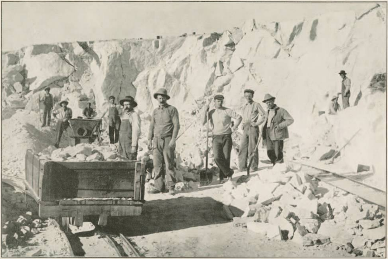
TUFA QUARRY AT FAIRMONT