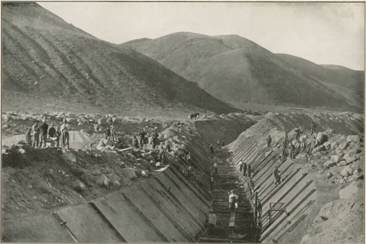
CONSTRUCTION OF OPEN LINED CANAL IN OWENS VALLEY