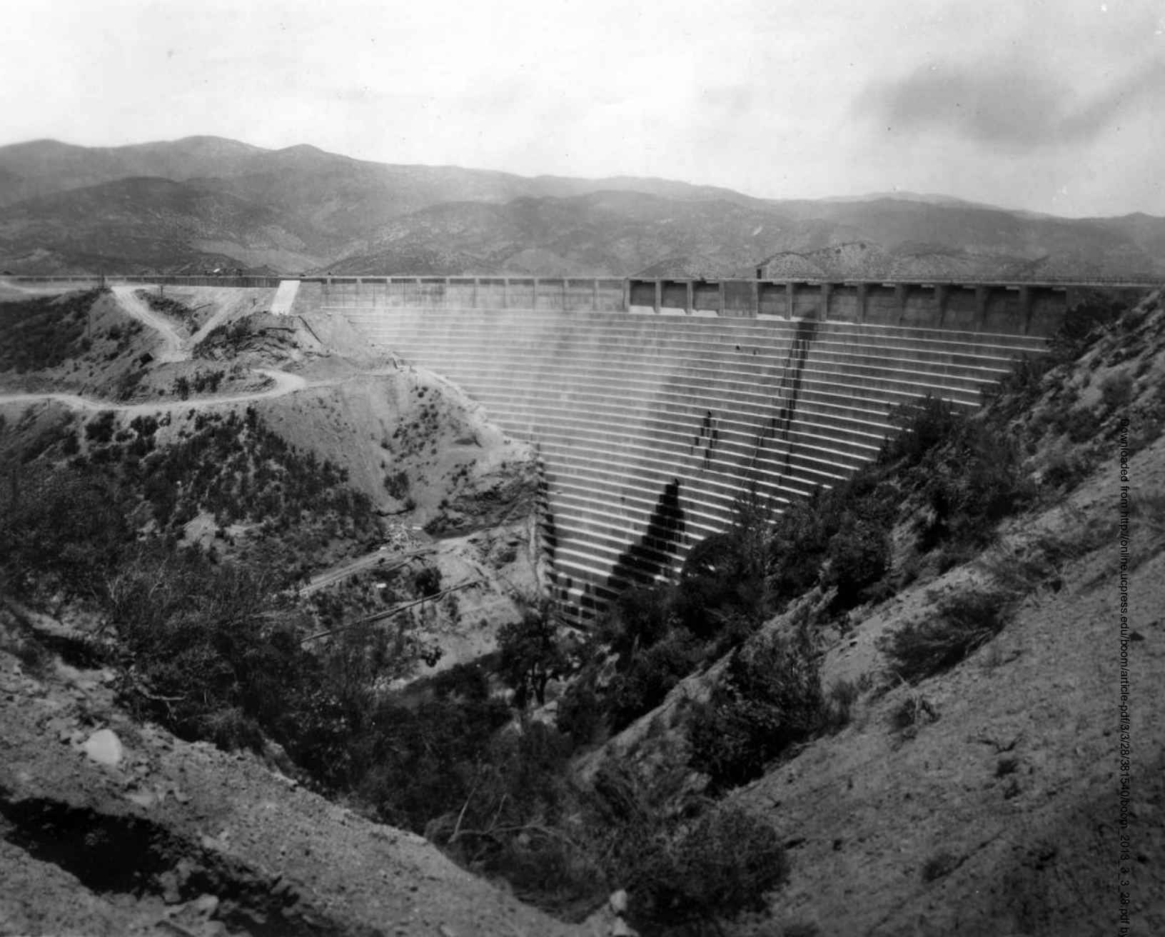
St. Francis Dam beginning to leak.

Cain is writing with his tongue partly in his cheek, of course, although not entirely; his mix of irony and credulity is one that anyone who has spent much time in LA knows all too well. How else are we to think about a metropolis built in a semi-desert, a get-rich-quick scheme that became something more? And yet, what resonates are those closing lines, the exciting whirlpools, the admission that he has no