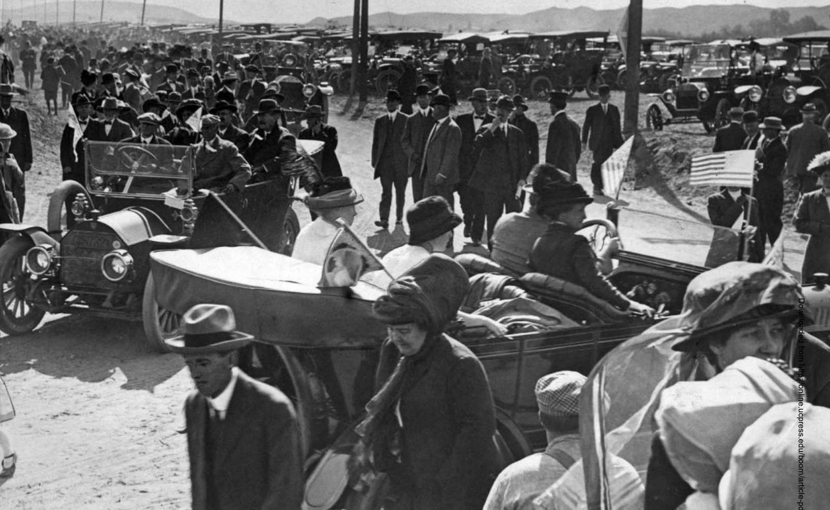
Crowds gathering at the opening of the Los Angeles Aqueduct.

town), the speechifying, and marvel as the sluice gates open and the stolen Owens River water starts to flow. One particularly striking shot, published in the following day's Los Angeles Times , portrays the cascade mid-torrent; as spectators line either side of the aqueduct, the water bursts through it, violent, unruly, its leading edge as angry as a storm-fed wave. In the foreground, we can see the pebbled bottom of the concrete channel, soon (in half a second) to be submerged. There's something so active, so aggressive, about this photo that it seems, almost, like a movie; we expect the water to explode into the frame. Minutes later, it is over, and another image evokes the aftermath: crowds starting to break up as behind them, water fills the aqueduct unimpeded. Los Angeles as we know it has been born.