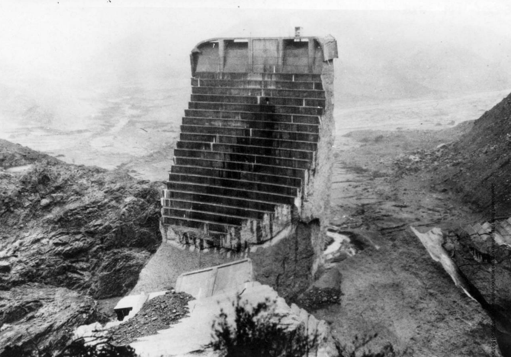
The remains of St. Francis Dam.

remained essentially in isolation until his death in 1935 at age seventy-nine. Although he was not held to be liable, an investigation concluded that the “construction and operation of a great dam should never be left to the sole judgment of one man.”