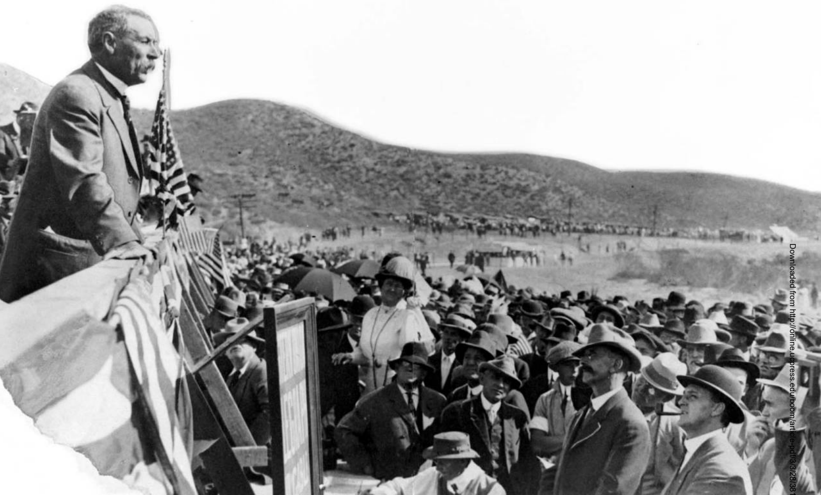
William Mulholland addresses the crowd.

the Mission Play so popular in those days. It was during this speech, after all, that Mulholland linked LA to a kind of manifest destiny. “This rude platform,” he declared, “is an altar, and on it we are here consecrating this water supply and dedicating this aqueduct to you and your children and your children’s children—for all time.” On the one hand, that’s to be expected, an expression both of Southern California’s relentless boosterism and also the most obvious, self-interested dodge. At the same time, it is merely prelude to what, I want to tell you, are the most resonant lines ever spoken about Los Angeles, five words that, to borrow a phrase from Joan Didion, “get very close to what it is about the place.” I have no idea if Mulholland knew what he was saying; apparently, he’d planned a formal presentation, but overwhelmed by the assembly, not to mention a ceremonial band and artillery pieces, he chose to cut it short. Regardless, as the water started flowing and Los Angeles mayor H.H. Rose stood beside him, Mulholland gestured toward