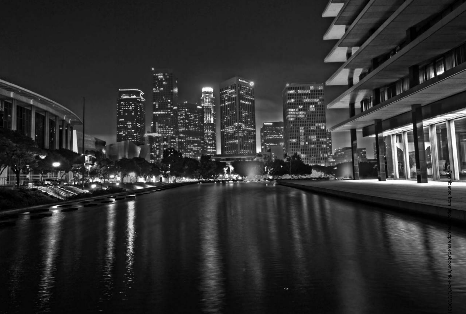
John Ferraro Office Building, Los Angeles Department of Water and Power headquarters.