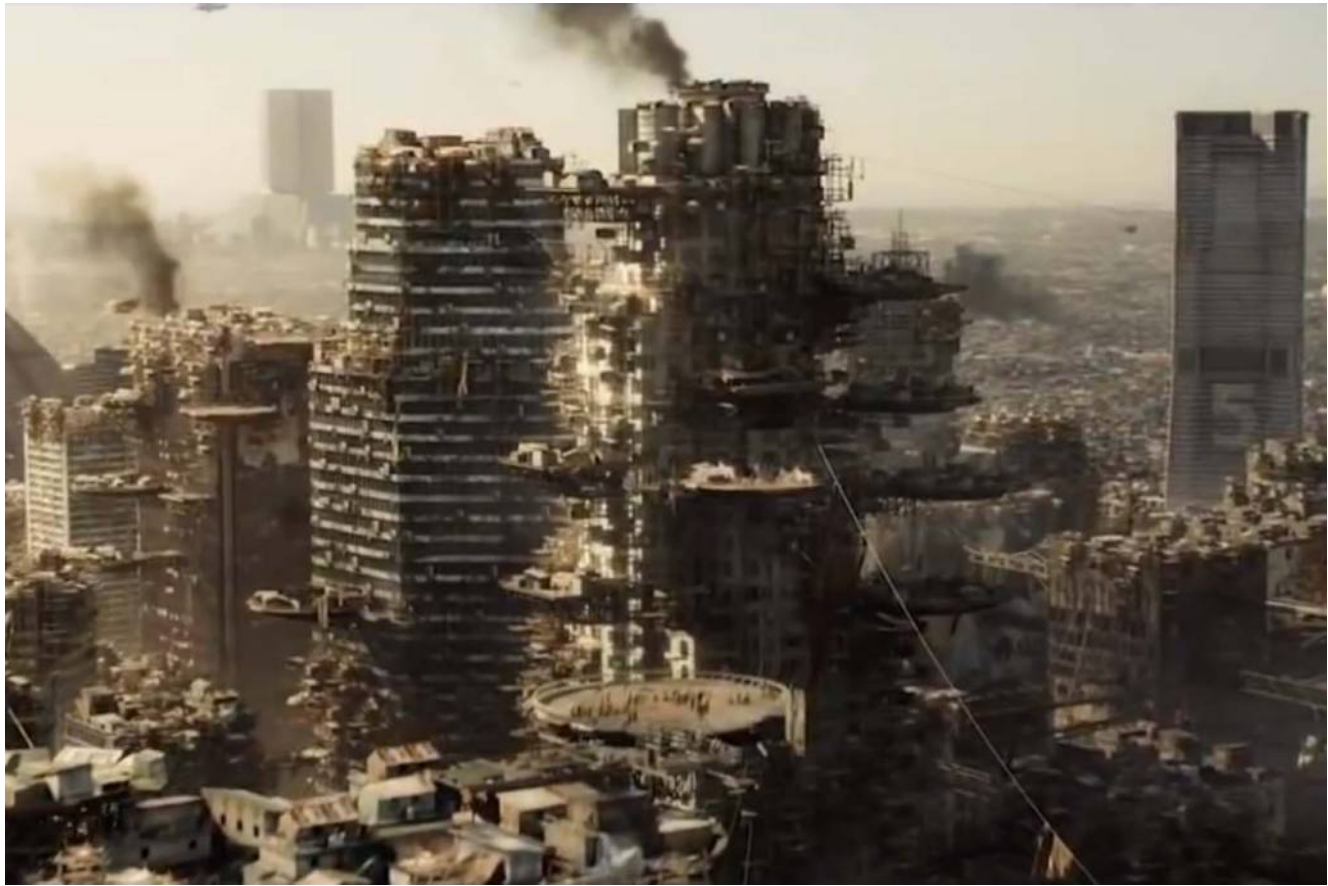
Downtown Los Angeles in 2154 in Elysium , TriStar Pictures, 2013.