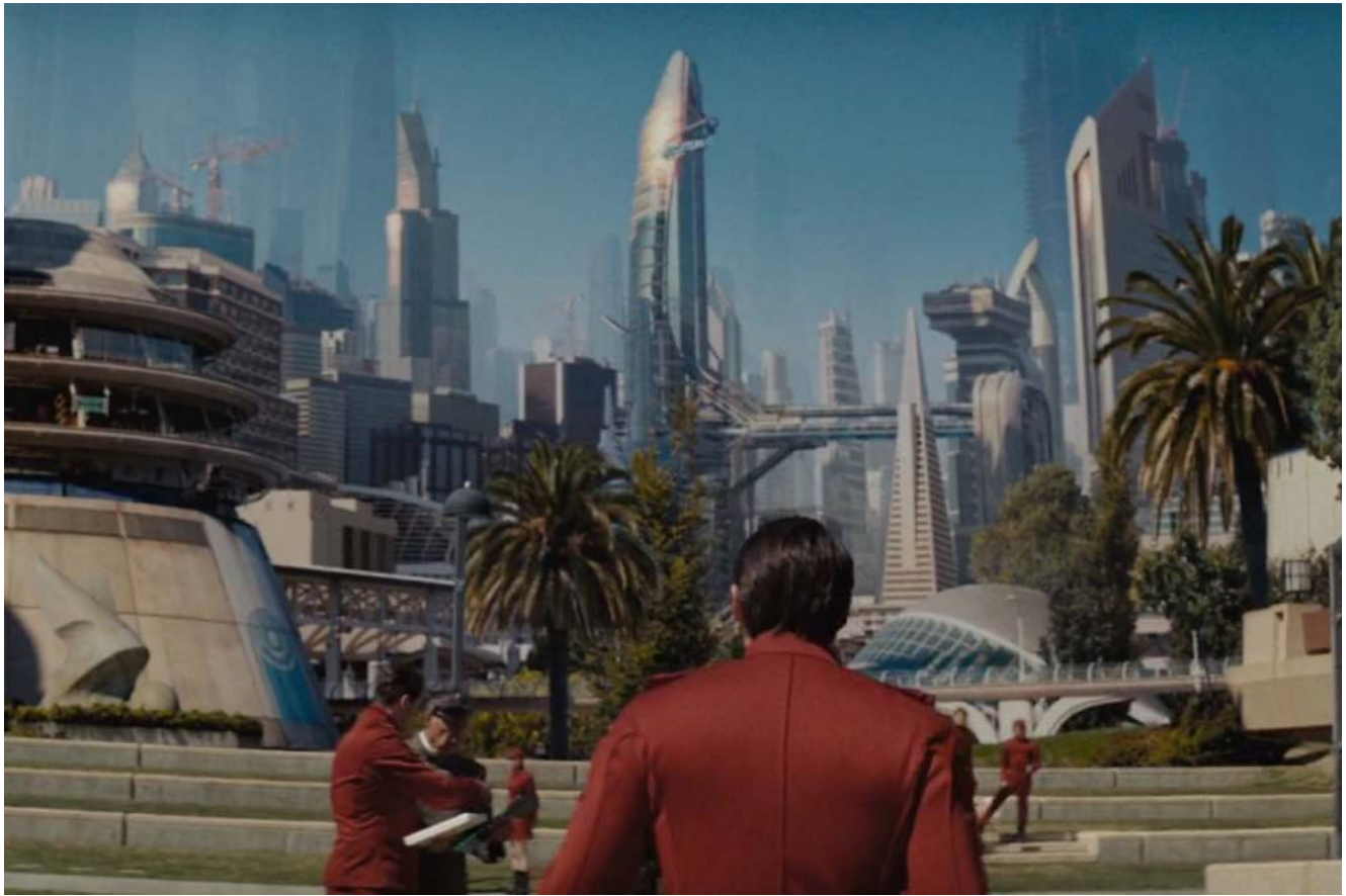
San Francisco in 2259 in Star Trek: Into Darkness , Paramount Pictures, 2013.

and wondrous. It's not just that so many are filmed here—writers and filmmakers have been exploring the future through California sets for decades.