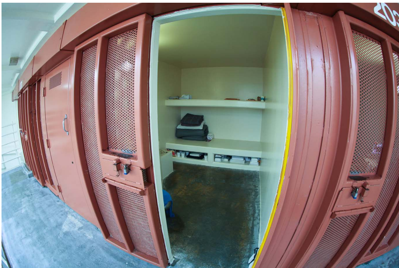
Pelican Bay State Prison Secure Housing Unit.

Court ordered California to follow through with the population reduction order and to fulfill the court orders to provide decent medical and mental health care. Yet despite the fact that California met its target of 137.5 percent of design capacity in January of 2016, the prisons remain a long way from respecting dignity. The problem is deeper than overcrowding. California's prisons were not designed with human dignity in mind.