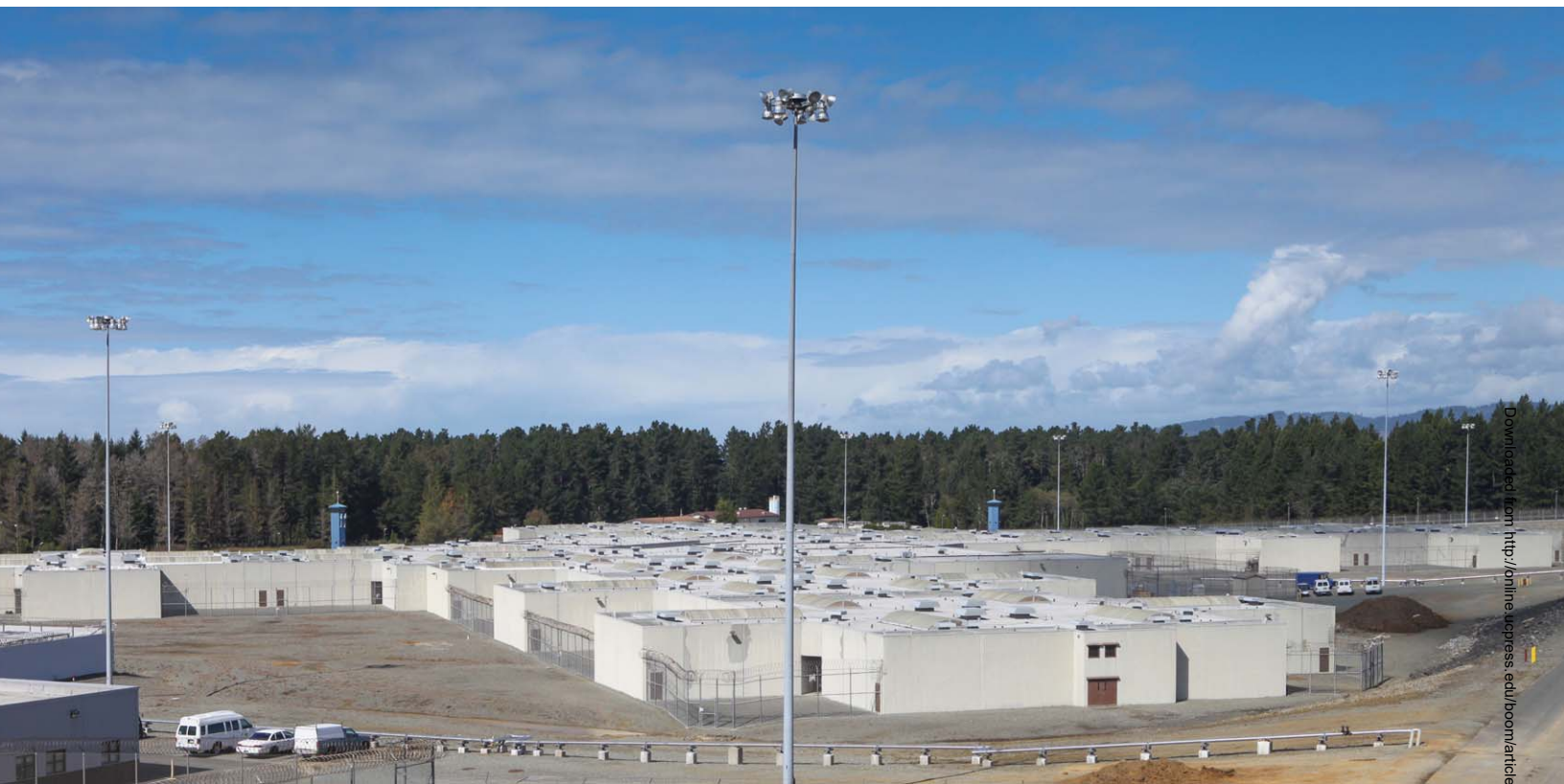
Pelican Bay State Prison Secure Housing Unit.

The related reason is medical. These prisoners, the most vulnerable in the system, are the tip of an iceberg of chronic illness in California prisons. In California, a rapidly aging prison population is especially vulnerable to chronic illness, where approximately 40 percent of prisoners have one or more, a fraction consistent with nationwide estimates. For younger people, especially men of color or involved in gang-based crime, prison may have a positive influence on health by dramatically lowering their risk of being shot and by giving them exposure, sometimes for the first time in years, to some kind of healthcare system. As people age in prison, however, chronic illnesses such as diabetes, hepatitis, and cancer become more common, some a product of the lifestyles that often accompany criminalization such as drug addiction and high-risk sex. Even in prisons where healthcare meets the basic minimums considered constitutionally adequate, chronic illness is likely to worsen considerably through the routine nature of boredom and (paradoxically) stress, combined with a poor diet, and greatly aggravated by overcrowding. In California, where healthcare has been