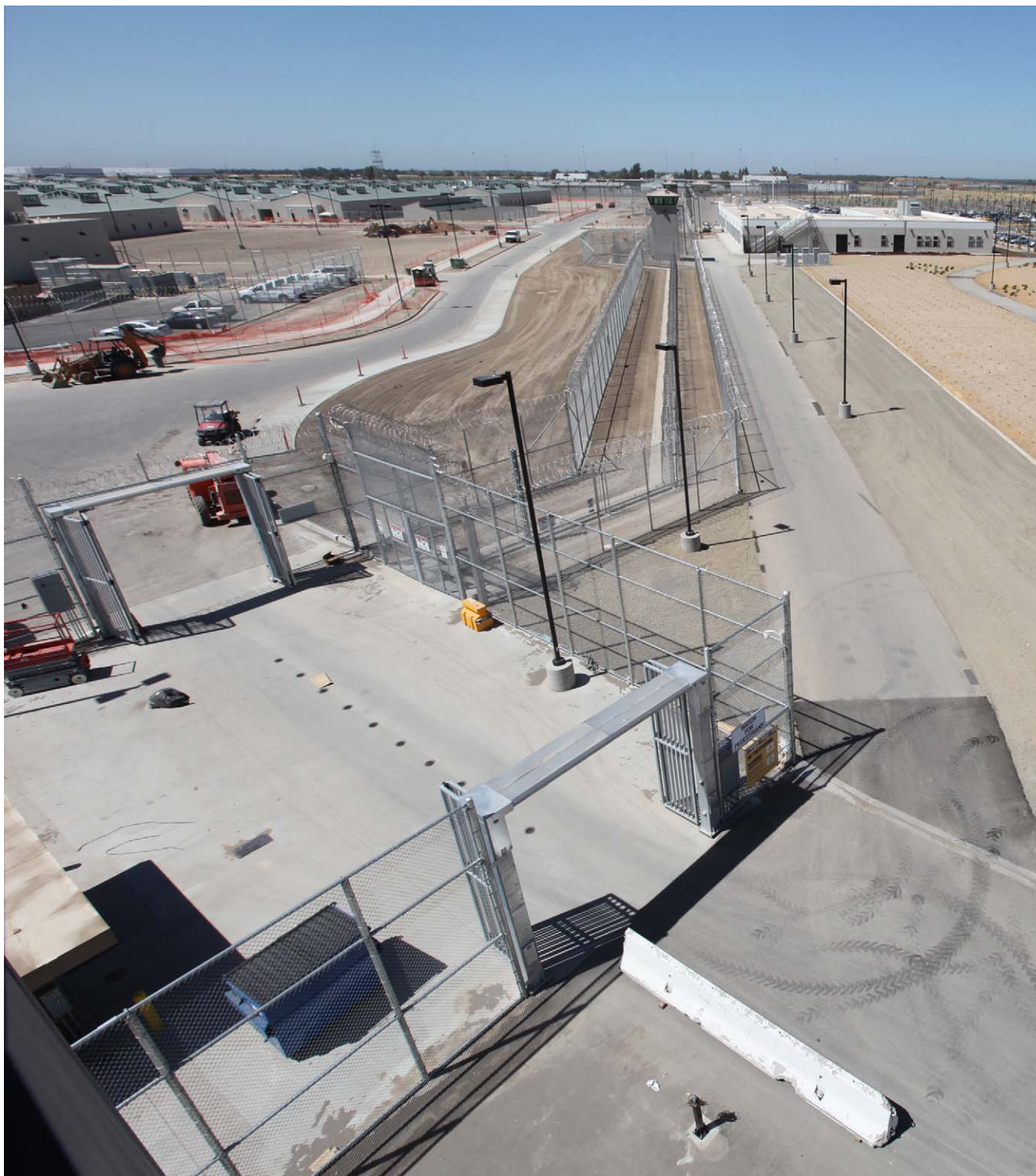
California Health Care Facility.