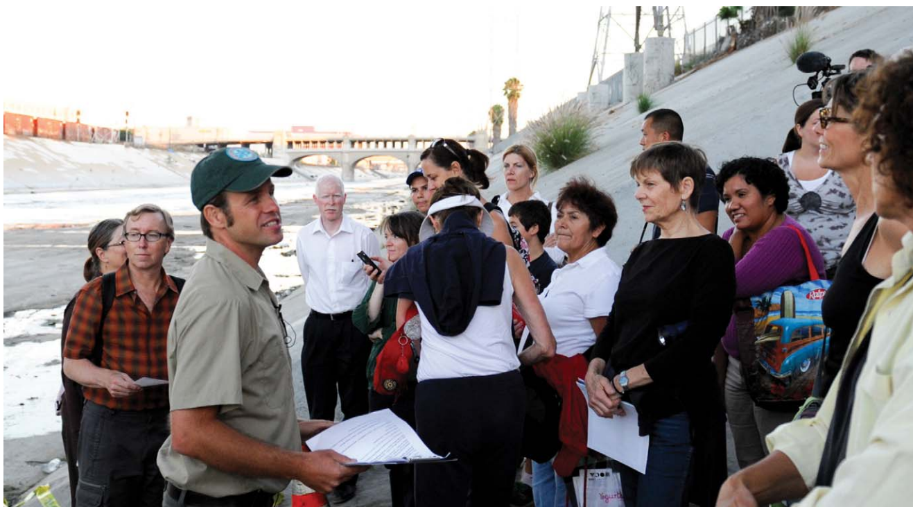
The Los Angeles Urban Rangers demonstrate that the megalopolis is a habitat for adventurous exploration; here a Ranger leads the LA River Ramble (2010-present).

or whose interests matter. The narratives that grow from those foundations govern the spectral array of possibilities. For example, the responses to flooding in the context of a channelized river are unlikely to begin with anything other than a channelized river; the most likely proposal is for a deeper channel. But there is no reason for conventional thinking to remain so constrained. What we call “urban humanities” produce historically grounded conjectures, launched from the present toward an unknown future, that depend on and simultaneously help construct new urban imaginaries.