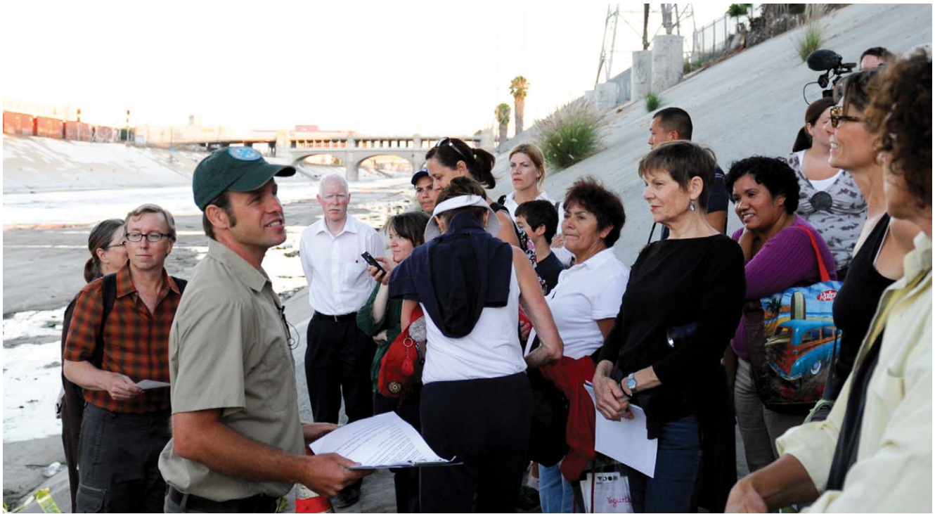
The Los Angeles Urban Rangers demonstrate that the megalopolis is a habitat for adventurous exploration; here a Ranger leads the LA River Ramble (2010-present).

or whose interests matter. The narratives that grow from those foundations govern the spectral array of possibilities. For example, the responses to flooding in the context of a channelized river are unlikely to begin with anything other than a channelized river; the most likely proposal is for a deeper channel. But there is no reason for conventional thinking to remain so constrained. What we call “urban humanities” produce historically grounded conjectures, launched from the present toward an unknown future, that depend on and simultaneously help construct new urban imaginaries.