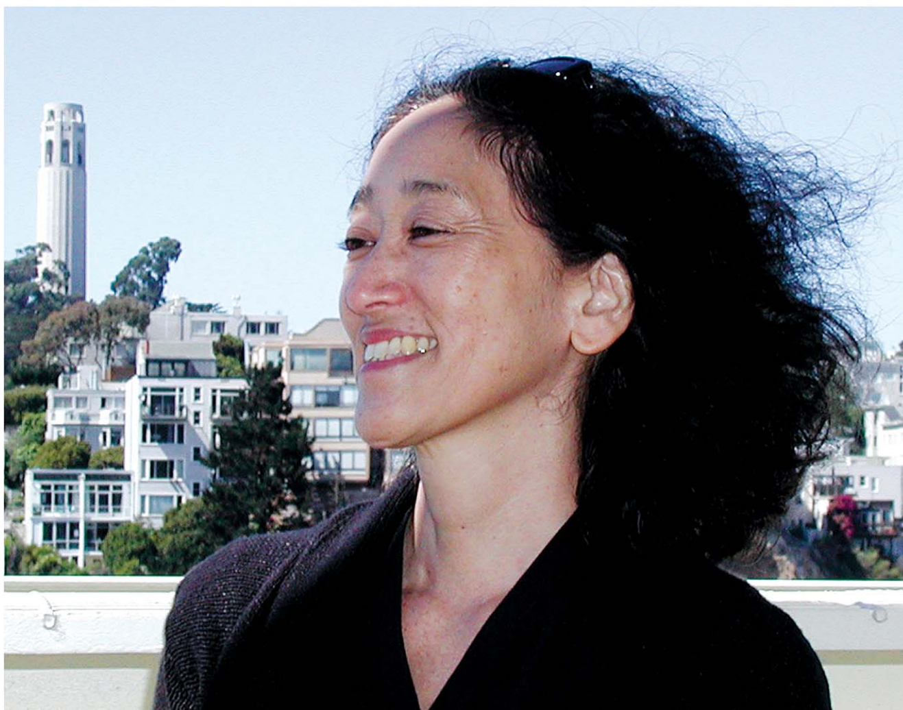
Photograph of Karen Tei Yamashita

Jefferson Blvd. and Normandie Ave. in the middle of an old Japanese American neighborhood. That church I understood to be the largest Japanese American congregation on the US mainland. I point this out because, in the postwar, Japanese American institutions such as temples and churches became centers of community and hostels to receive Japanese Americans returning from wartime incarceration. My father ran such a hostel/church in Oakland, then came to continue his work in LA, largely to minister to a community of young nisei families trying to get a jumpstart on new lives. With the wartime evacuation of Japanese Americans out of LA arrived the influx of African Americans who came to work in wartime industries and occupied our abandoned neighborhoods. In the postwar 1950s and 1960s when I grew up in LA, our neighborhood around the