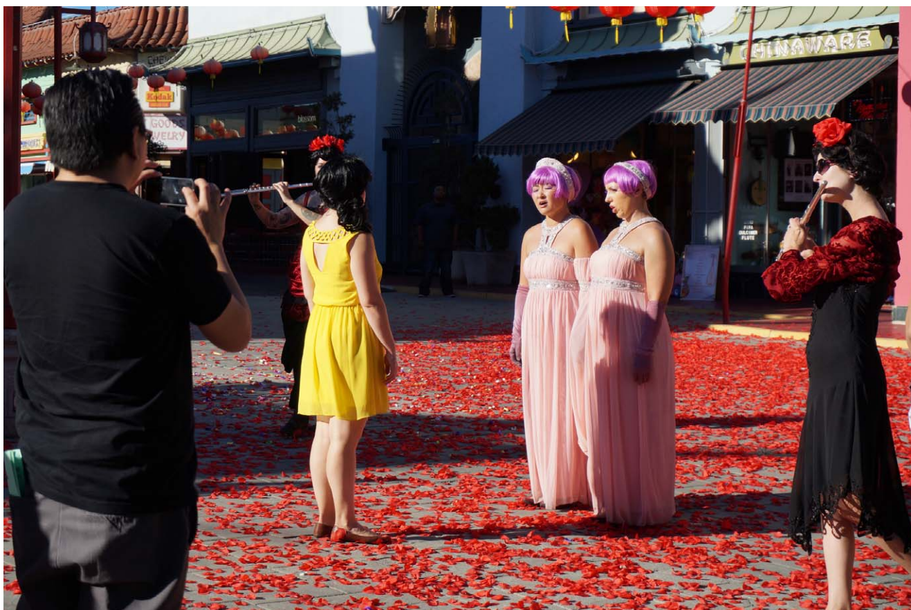
A performance of Hopscotch .

otherworldly fantasy—as it was embedded in the messy reality of urban space. At one point, a homeless person noticed the captive audience and began singing her own tune before a nervous stagehand awkwardly ushered her away to receive her own headset. And, of course, the inversion of who is watching and who is being watched cannot go unstated: as much as we privileged theatergoers invaded this space and tried to watch as much of the frenetic and fractured performance as we could, so too were we being gawked at by passers-by. We were a funny-looking mob of confused people with wireless headsets on, providing our own free show. There was none of the unidirectional comfort of a darkened theater. In this strange, ambivalent way, the audience’s discomfort with being implicated by the performance’s dynamics—of power, of privilege, of post-modern obtuseness—became absorbed into the opera, suggesting an alternative, immanent reality that had the potential to come into being.