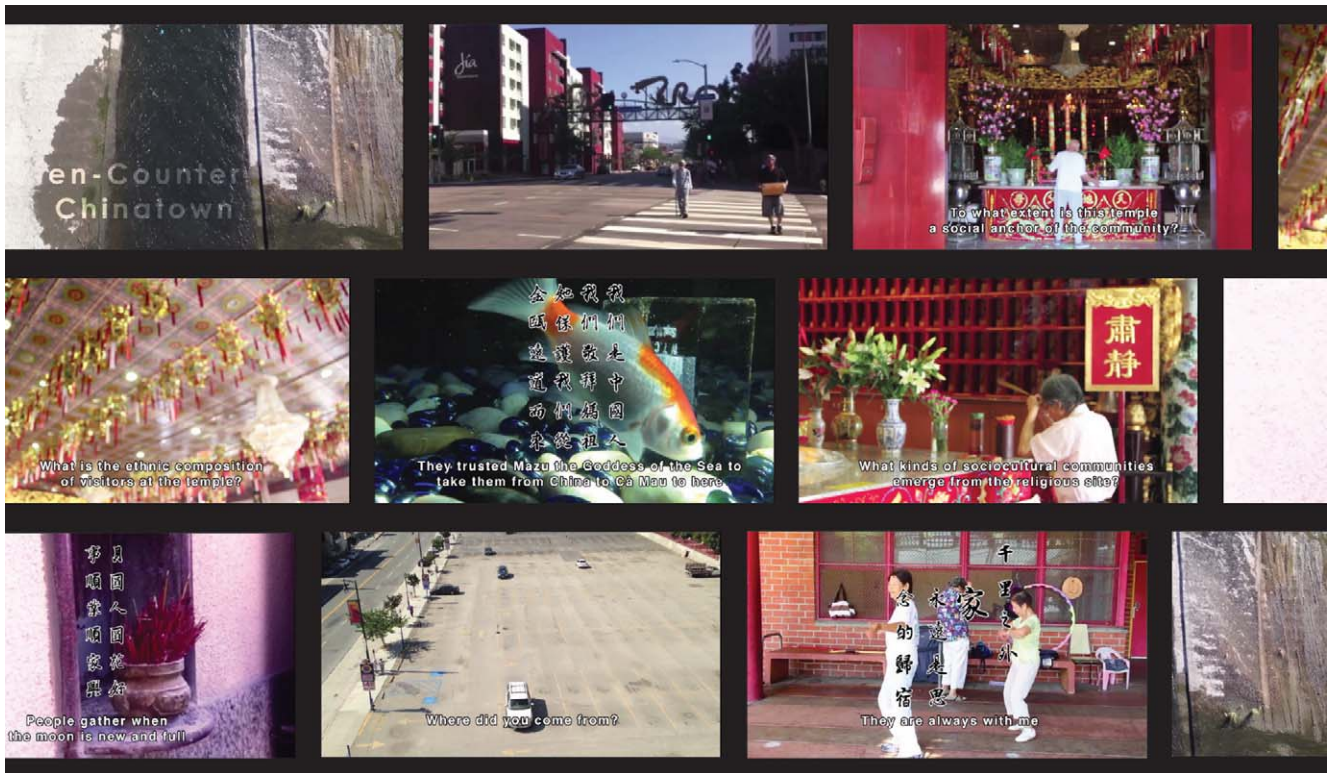
Scenes from Encounter Chinatown.

upon the one we knew. A question like “Who is Chinatown?” which on first blush sounds ridiculous now begins to make some sort of odd sense. Aren’t these the questions that any critically minded scholar first asks of a situation? For whom is this neighborhood meant? And who else is excluded? There is, again, a touch of the supernatural. Between shots of incense and prayers, the video’s rhythm is maintained only through a Buddhist monk’s tolling of the bells. It asks us to slow down, to read between the lines. Is there another Chinatown present, one that we looked past before? This immanent speculation is easy to brush past because it lacks the didactic quality of a futurist’s homily or the spectacle of an opera on wheels, but given time it is perhaps even more effective, more seductive, because we are the ones who are compelled to complete the task of speculation. We are given time and space with which we can attempt to make sense of the swirling assemblage of images before us.