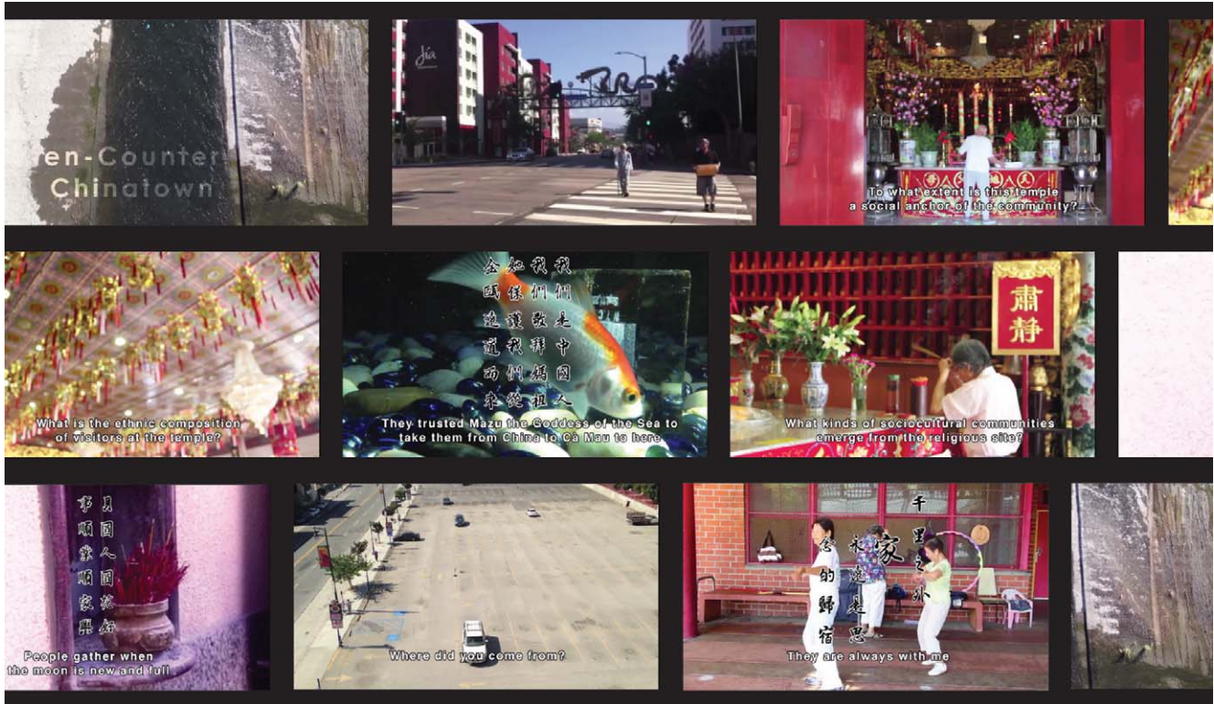
Scenes from Encounter Chinatown.

upon the one we knew. A question like “Who is Chinatown?” which on first blush sounds ridiculous now begins to make some sort of odd sense. Aren’t these the questions that any critically minded scholar first asks of a situation? For whom is this neighborhood meant? And who else is excluded? There is, again, a touch of the supernatural. Between shots of incense and prayers, the video’s rhythm is maintained only through a Buddhist monk’s tolling of the bells. It asks us to slow down, to read between the lines. Is there another Chinatown present, one that we looked past before? This immanent speculation is easy to brush past because it lacks the didactic quality of a futurist’s homily or the spectacle of an opera on wheels, but given time it is perhaps even more effective, more seductive, because we are the ones who are compelled to complete the task of speculation. We are given time and space with which we can attempt to make sense of the swirling assemblage of images before us.