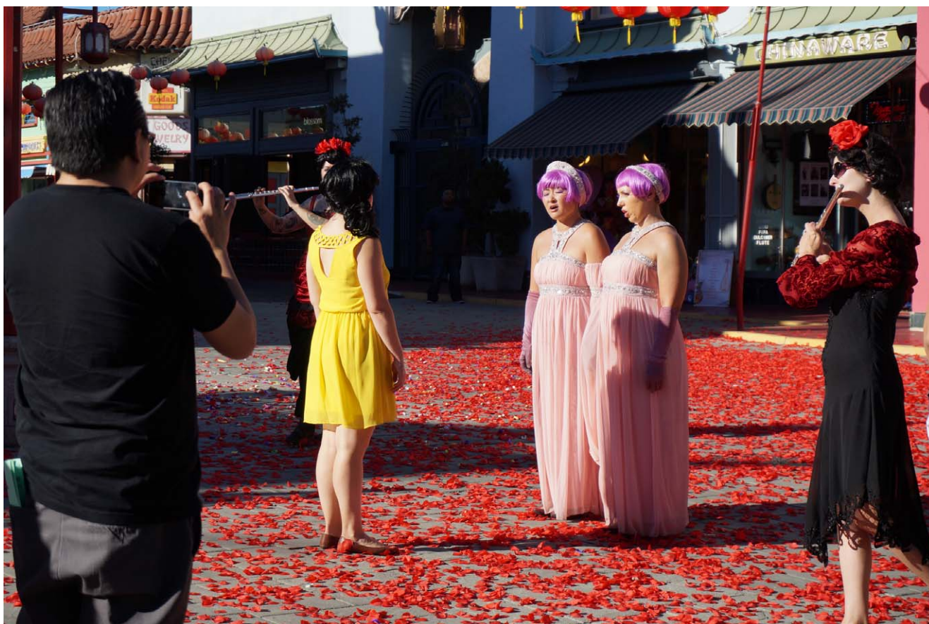
A performance of Hopscotch .

otherworldly fantasy—as it was embedded in the messy reality of urban space. At one point, a homeless person noticed the captive audience and began singing her own tune before a nervous stagehand awkwardly ushered her away to receive her own headset. And, of course, the inversion of who is watching and who is being watched cannot go unstated: as much as we privileged theatergoers invaded this space and tried to watch as much of the frenetic and fractured performance as we could, so too were we being gawked at by passers-by. We were a funny-looking mob of confused people with wireless headsets on, providing our own free show. There was none of the unidirectional comfort of a darkened theater. In this strange, ambivalent way, the audience’s discomfort with being implicated by the performance’s dynamics—of power, of privilege, of post-modern obtuseness—became absorbed into the opera, suggesting an alternative, immanent reality that had the potential to come into being.