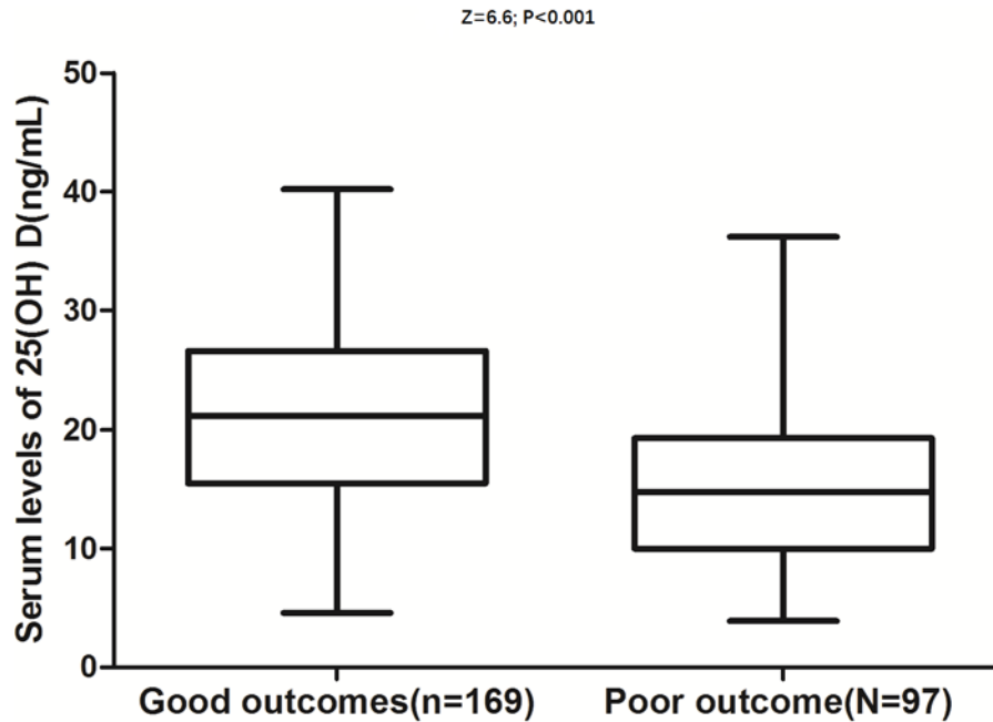
Figure 1. Distribution of 25(OH) D in stroke patients with poor functional outcomes and good functional outcomes

Horizontal lines represent medians and IQRs. P-values refer to Mann–Whitney U tests for differences between groups. Poor functional outcome was defined as mRS in 3–6 point.