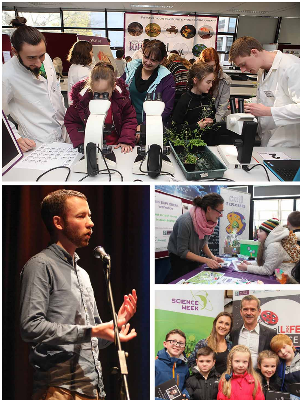
Figure 2. Researchers can engage in a diverse range of activities when starting with public engagement in science.