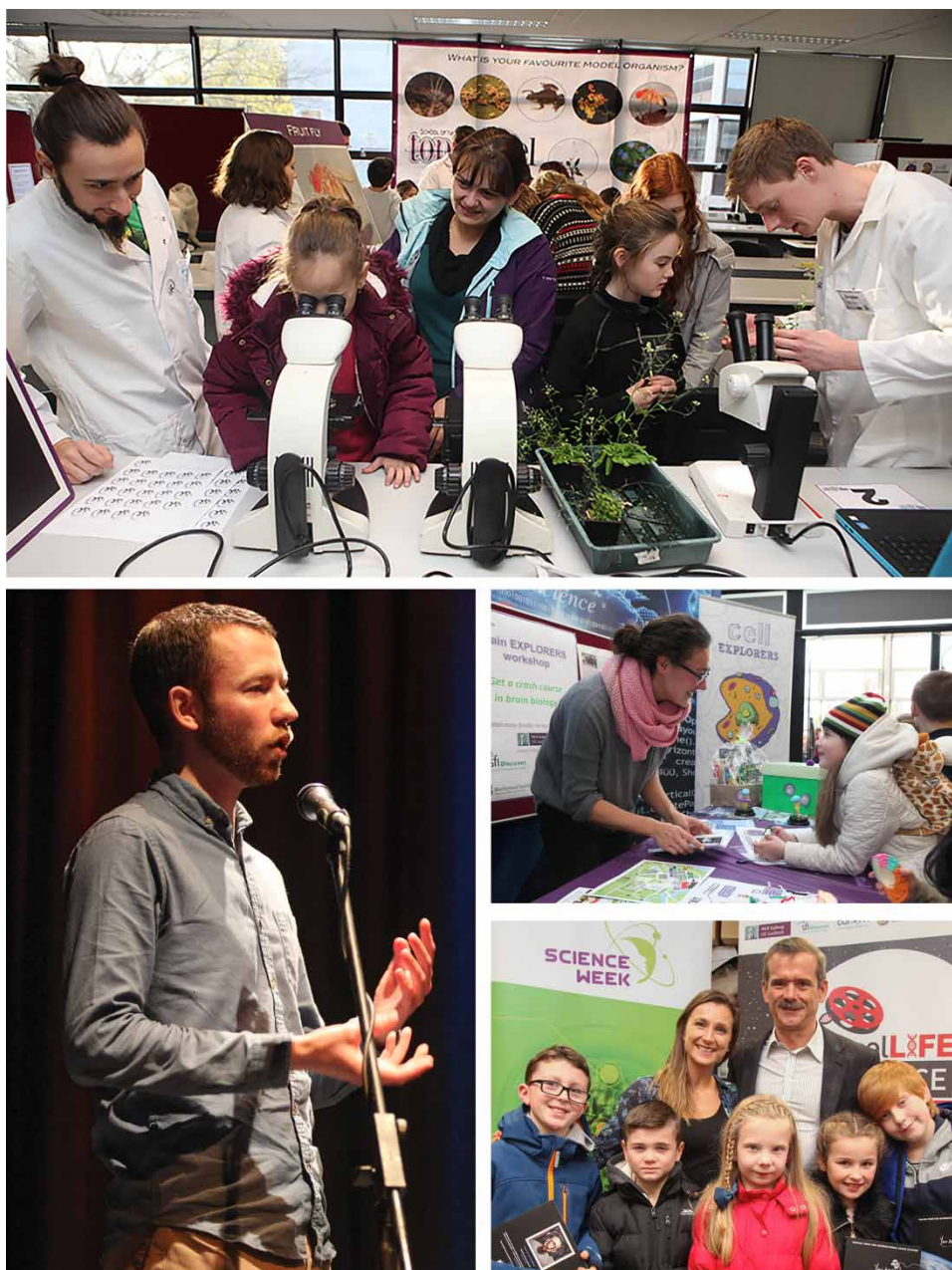
Figure 2. Researchers can engage in a diverse range of activities when starting with public engagement in science.