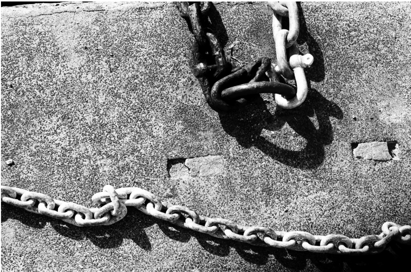
Chains black and white, Cape Town, 2017.