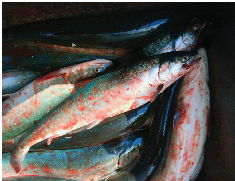
6.1 Arctic char caught in Nain, Canada, 2016.