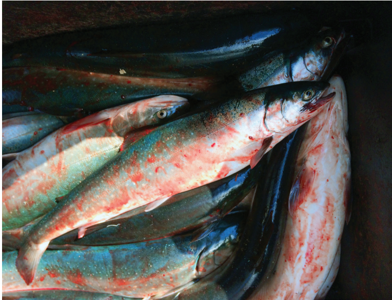
6.1 Arctic char caught in Nain, Canada, 2016.