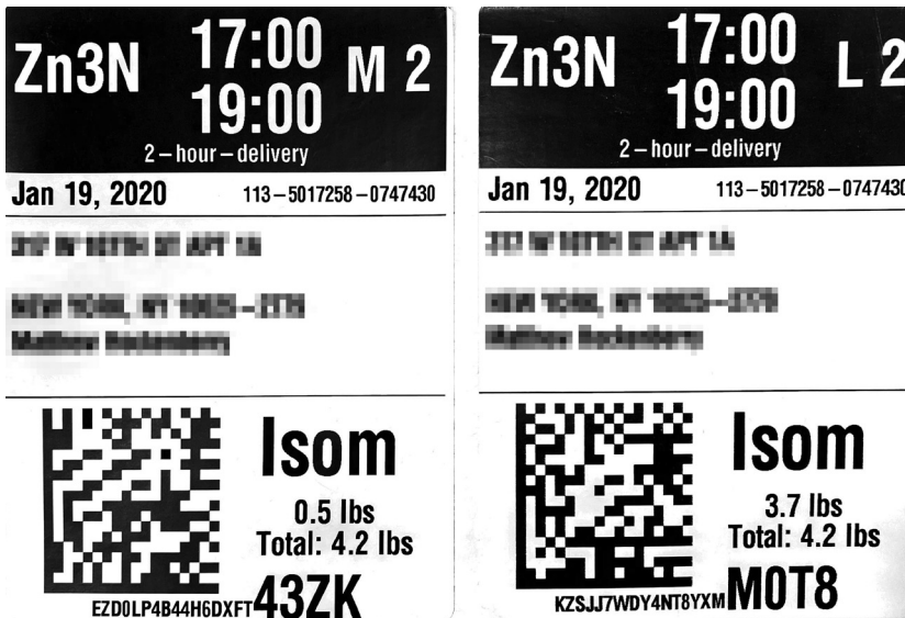
Figure 15.2 Barcode stickers from a Prime Now order delivered via Amazon Flex.

When a driver indicates they have arrived at a destination, the app is supposed to provide all the protocols for delivery: Does the recipient need to be present, do they require an access code, and is there a preferred drop-off location? Workers verify they have delivered packages by recording an image to their phone. For customers, these porch pictures confirm that their items have been delivered. For Amazon, it ensures compliance from the driver. It may seem surprising that these are the only real images taken during the entire process. But the purpose of the other pictures is to scan two-dimensional barcodes, not to record the objects they are attached to. Flex’s operations are heavily mediated even at the moment of delivery. After all, completing an order is not about interacting with the customer. When, for example, a bike delivery driver arrives at their destination and puts down their (usually waterproof) duffel bag, they are directed only to look for the printed sticker containing the delivery’s optical machine code and its short (human-readable) four-character identifier (see figure 15.2). With Flex recalling for them how many items are to be delivered, it is just a matter of assembling and scanning the correct number of matching codes. As the system does not intend for the consumer to see the worker, the worker need not see the consumer. It is the camera—the system—that sees.