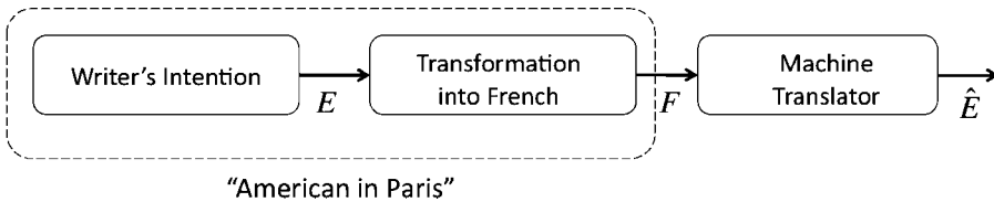
Figure 4 Schematic of statistical machine translation.

NSF grant for grammatical development. The eventual result was SPATTER, implemented by David Magerman. It used statistics, decision trees, and a history-based operation. The University of Pennsylvania graduate student Eric Brill developed his transformation-based learning (Brill 1992) that he applied to part-of-speech tagging and grammar derivation. Ezra Black of IBM organized a committee whose aim was the specification of a metric suitable for evaluation of parser performance. The result was the PARSEVAL measure.