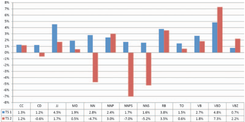
Figure 2 Deviation in percentage of correctly classified instances from the baseline feature set (cf. Table 2) for each added PoS tag frequency and test set (TS 1/2, cf. Table 1). CC = coordinating conjunction; CD = cardinal number; JJ = adjective; MD = modal; NN = singular noun; NNP = proper noun; NNPS = plural proper noun; NNS = plural noun; RB = adverb; TO = to; VB = base form verb; VBD = past tense verb; VBZ = third-person singular present verb.

if somewhat weaker effect, can be observed for the CD (cardinal number) frequency. Other PoS tags like CC (coordinating conjunction), RB (adverb), and VB (base form verb) increase predictive power while not impairing stability. Even more interesting are the results for the tags VBD (past tense verb) and VBZ (third-person singular present verb). Adding these features eliminates the significant difference between accuracies on test set 1 and 2, which we observed on the baseline feature set.