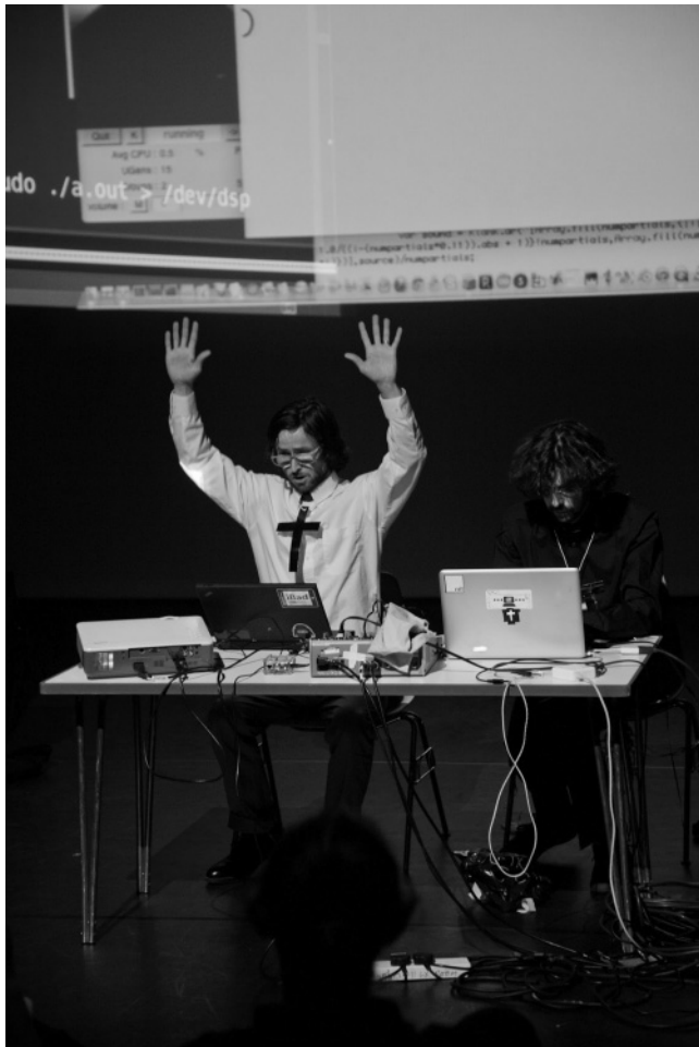
Figure 2. Wrongheaded preaching code at the Arnolfini in Bristol.