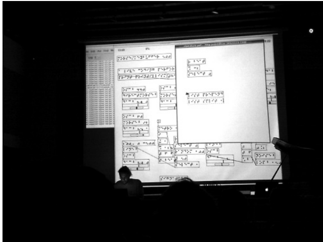
Figure 4. IOhannes m zmölnig live coding with Pure Data.

This simulates a chat client and allows novices in computer programming to live code music in larger ensembles over a wireless network in the same location or in a distributed performance. The system encourages not only conversation and collaboration between performers, but also the borrowing and adoption of code, practically rendering the question of authorship in this collaborative performance setup meaningless. A more recent system called SGLC (Lee and Freeman 2013) builds on LOLC, but aims at the inclusion of acoustic instruments through the use of traditional staff notation.