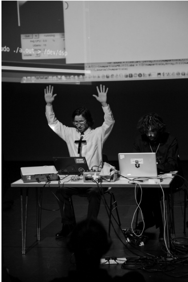
Figure 2. Wrongheaded preaching code at the Arnolfini in Bristol.