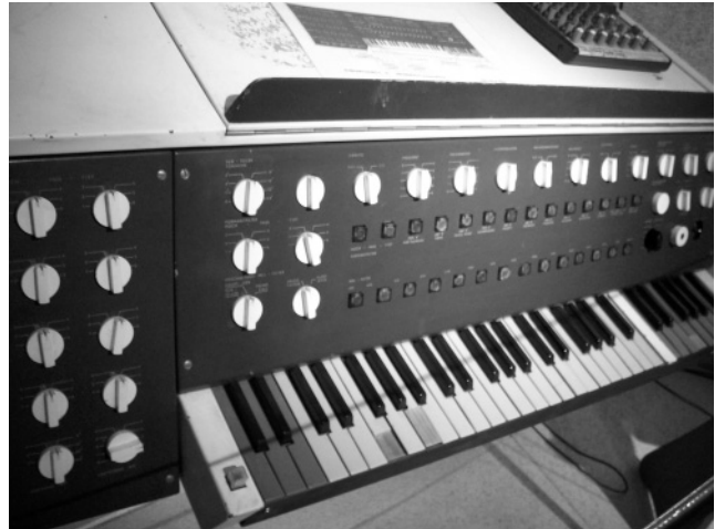
Figure 2. The Subharchord (1964), Gerhard Steinke used in the Bratislava Studio, now located in Vienna. For further details, see the articles by Ernst Schreiber (1964), Gerhard Steinke (1966), Tatjana Böhme-Mehner (2011), and the overview available at www.adk.de/en/academy/studio-for-electroacoustic-music/subharchord.htm .

to develop a new musical instrument called the Subharchord, which generated sounds electronically (see Figure 2). This instrument was actually built, and it formed the center of a working studio. That was a laboratory for research and development.