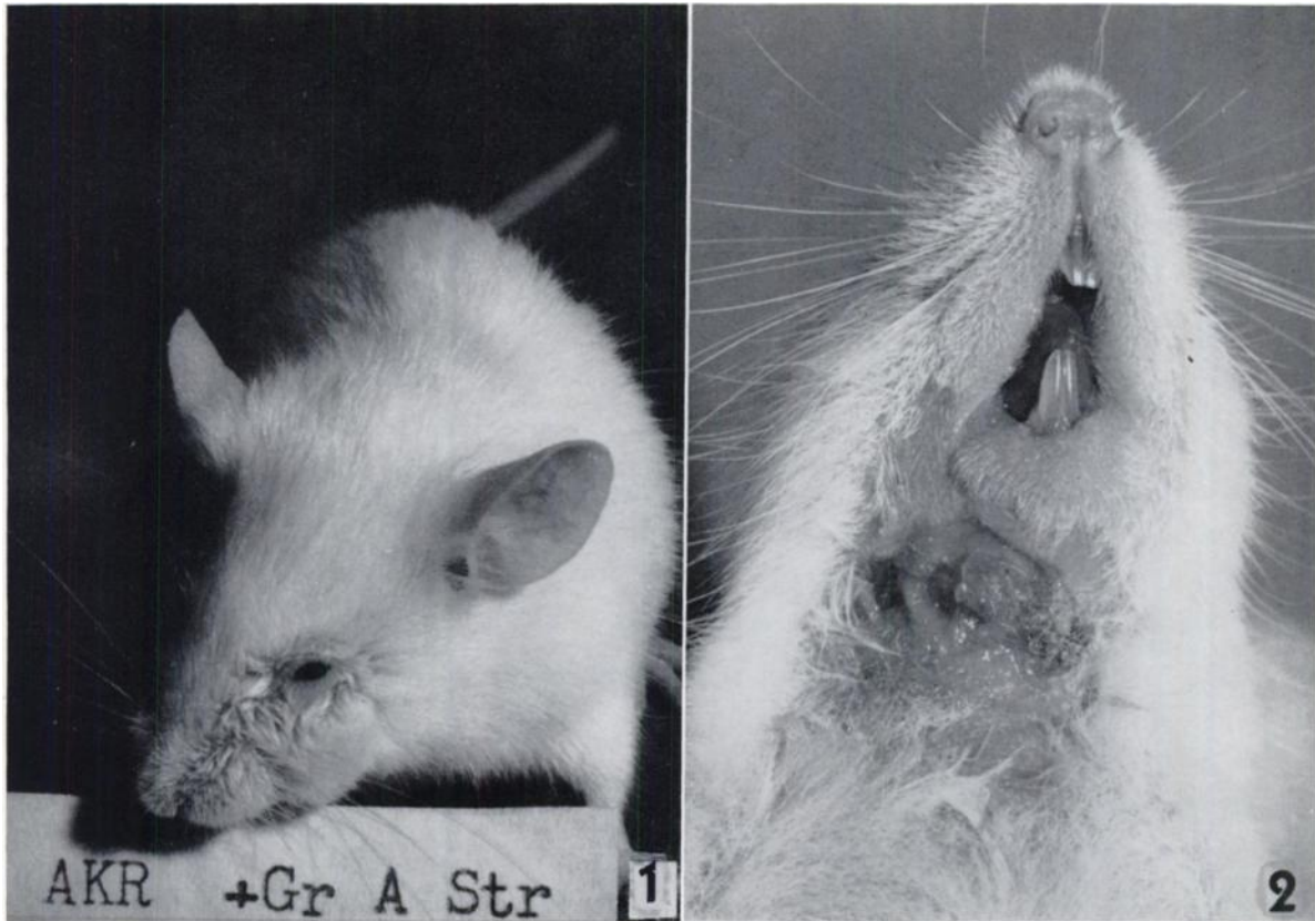
FIG. 1. —Photograph showing characteristic blood-encrusted eyes in AKR mouse with lymphadenitis induced by nasal deposition of Group A streptococci.