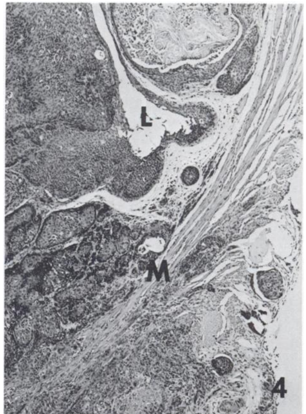
Fig. 1. Transitional cell carcinoma of the urinary bladder. H & E, \times 20 .