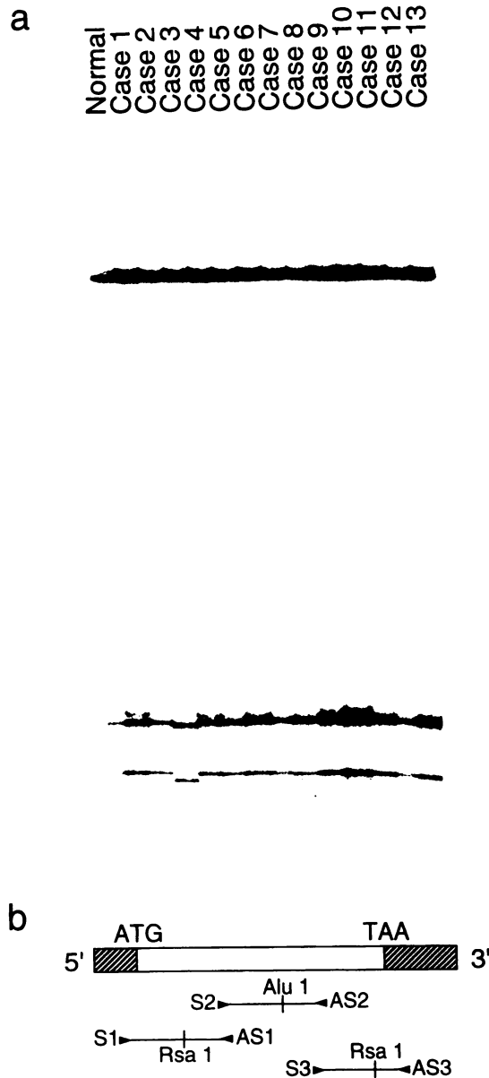
Fig. 1. PCR-SSCP analysis of the JV18-1 gene in lung cancer specimens. a , representative results of PCR-SSCP analysis using S3 and AS3 primers. Abnormal mobility shifts are apparent in cases 3 and 8. b , Schematic diagram of the strategy for PCR-SSCP analysis of JV18-1 cDNAs as well as that of JV18-1 mRNA are shown. Open box , coding region; stippled boxes , 5' and 3' untranslated regions. Restriction enzymes used to yield higher sensitivities due to smaller sizes are indicated.

wild-type alleles were expressed at similar levels in the lung cancer RNA of case 8, consistent with retention of heterozygosity observed on Southern blot analysis.