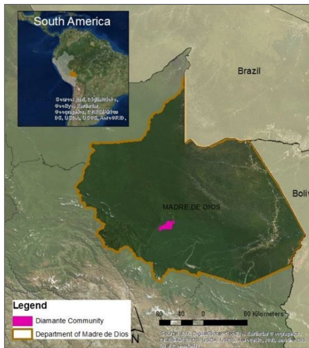
FIGURE 2. Map of Diamante community, Madre de Dios Peru.